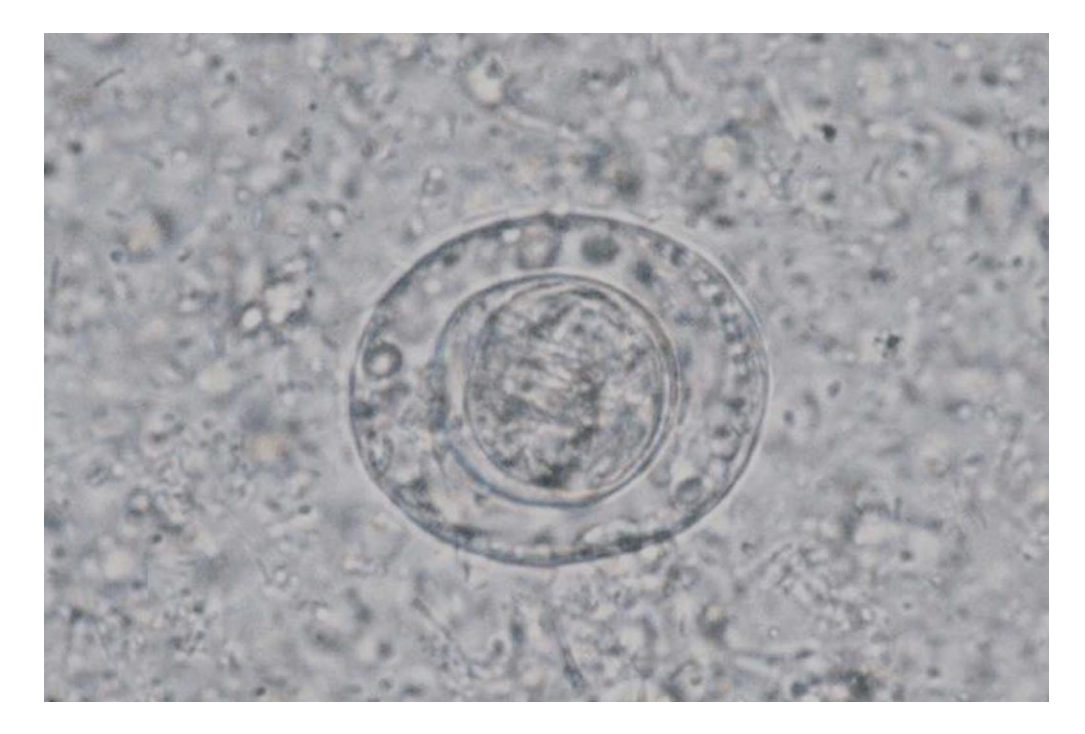
Photograph III: An egg of H. nana (Sample no. F23). It contains outer thin and colorless membrane and inner membrane enclosing oncosphere with 3 pairs of hooklets.