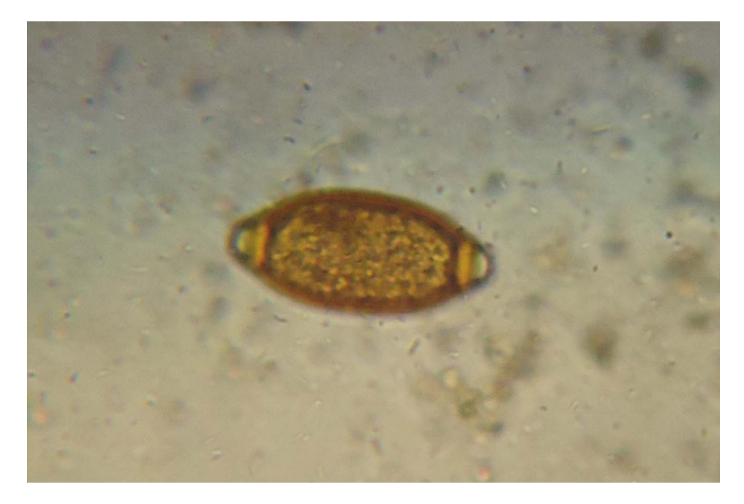
Photograph I: An egg of T. trichiura (Sample no. P12). It contains double shell, barrel shape, mucus plug at each pole and unsegmented ovum.