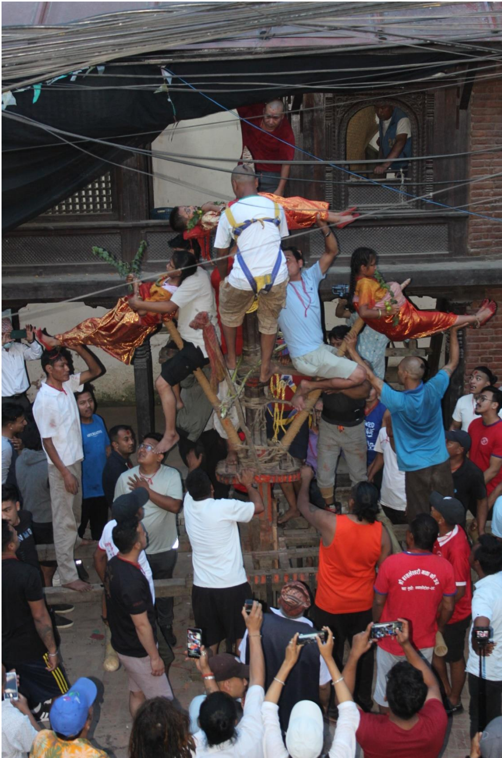
Figure 14 Putting three children on the chariot at Jayabageshwori temple premise, here chariot resembles a trident