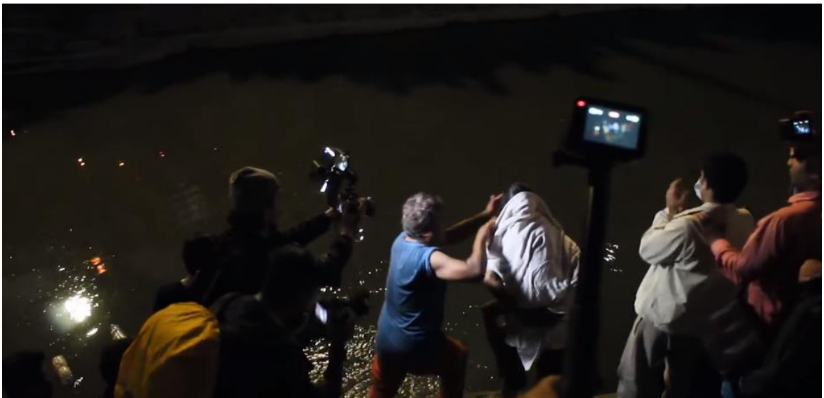
Figure 23 Spilling some drops of water on the children, and then ending the jatra