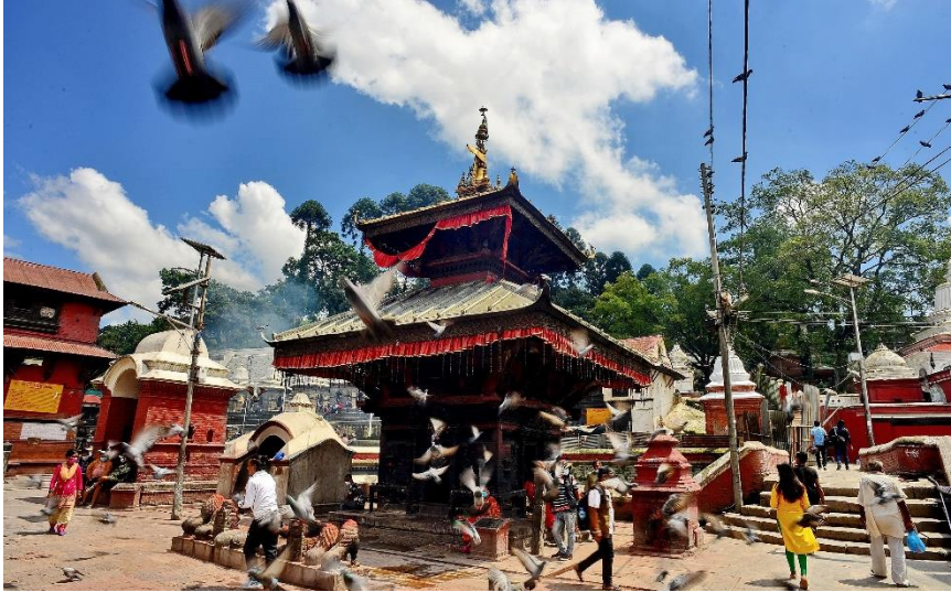
Figure 5 Batsleshwori Temple complex, from here two children are put in two different chariots