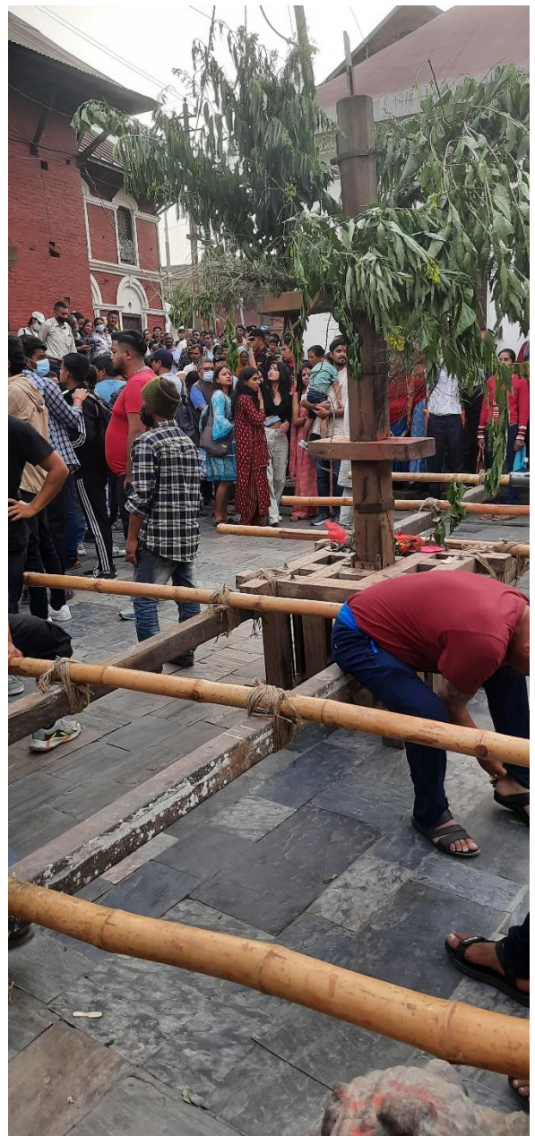
Figure 9 Assembling and decorating Chariot at Bachhaleshwori temple premise