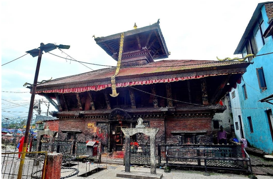
Figure 3 Bhuvaneshwori Temple