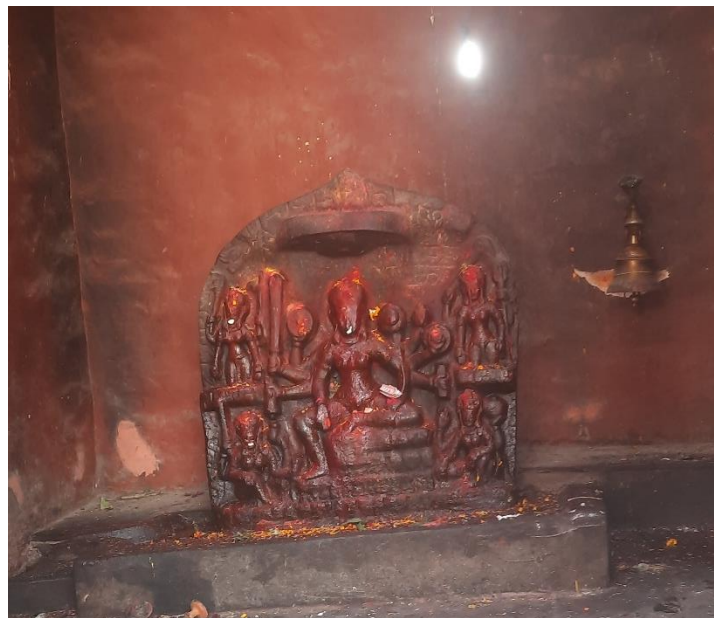
Figure 2 Idol of Mangalagauri