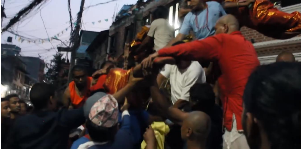
Figure 20 Due to some issue, the kumar of Jayabageshwori chariot was brought down from the chariot in between the parade