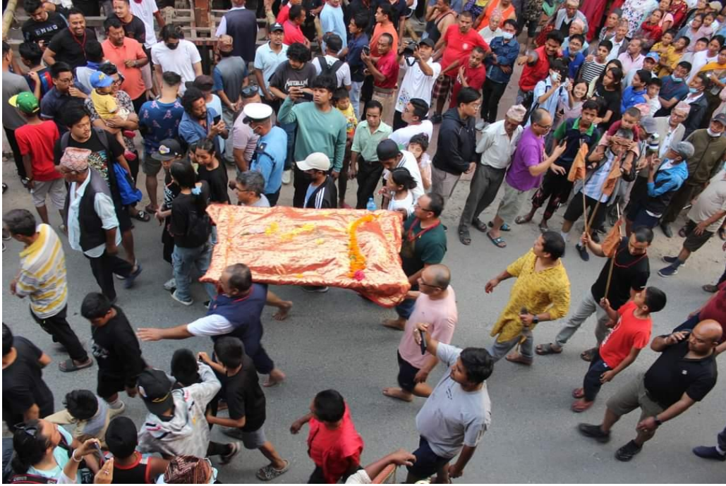
Figure 17 Corpse made of muswa flowe covered by red fabric joins parade from Bhuvaneshwori