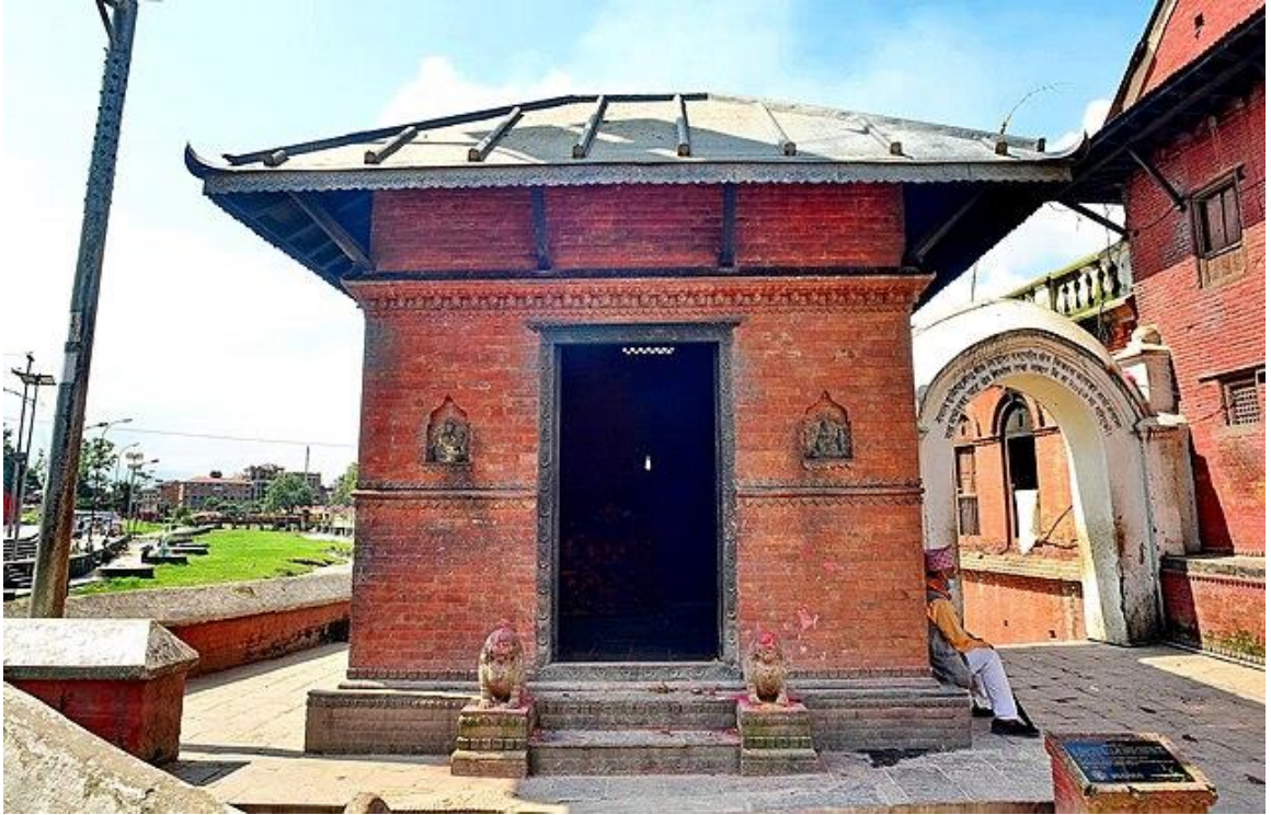
Figure 1 Mangala Gauri/Jaya Mangala Shrine