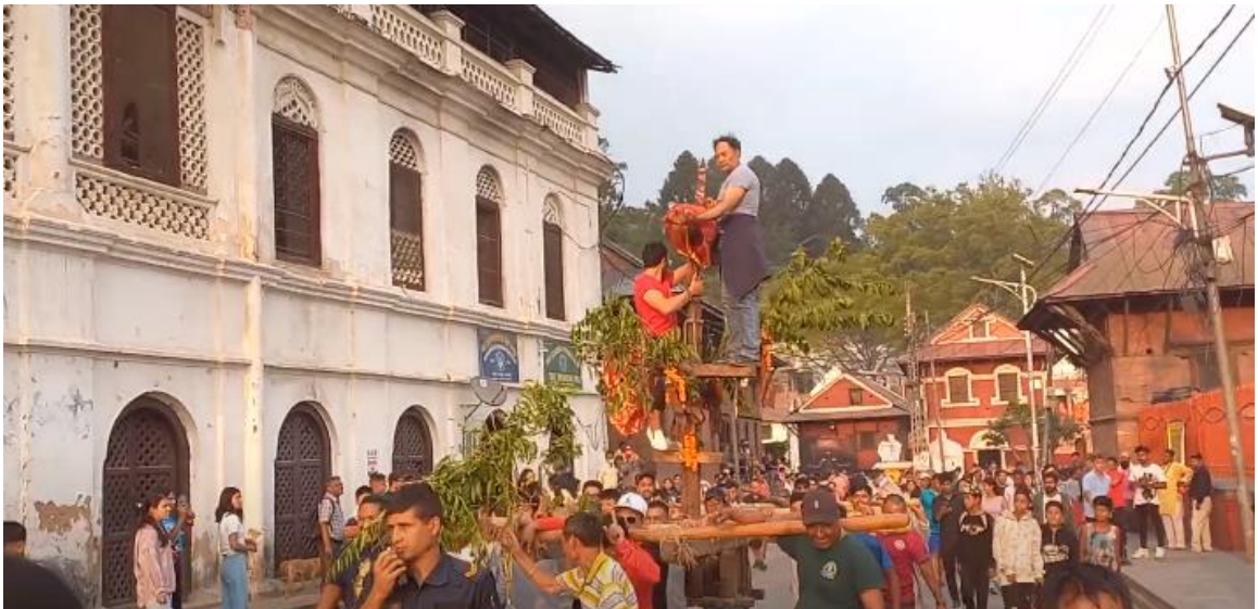
Figure 13 Procession begins, as locals carry the chariot. This chariot is immediately followed by other two