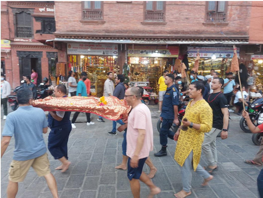
Figure 18 Behind the corpse walks priest of Bhuvaneshwori ringing bell and locals holding sticks with child clothes