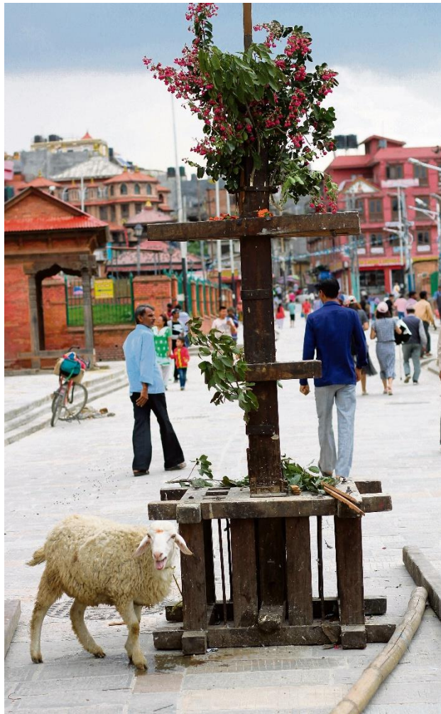
Figure 6 Decorated chariot of Trishul jatra along with a sacrificial goat