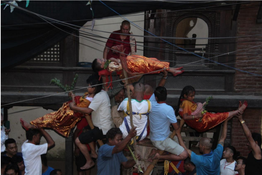
Figure 15 Three children- one kumar/boy at center, two kumari/girls at two sides