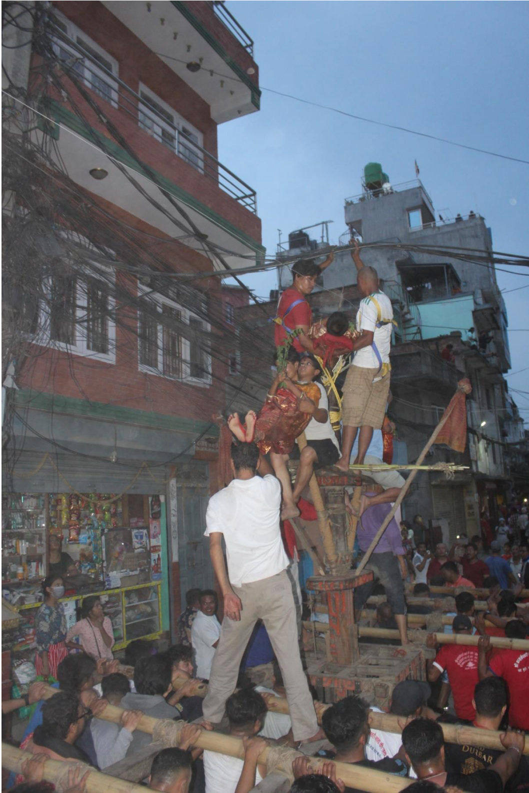
Figure 19 Wires making it difficult to navigate the chariot