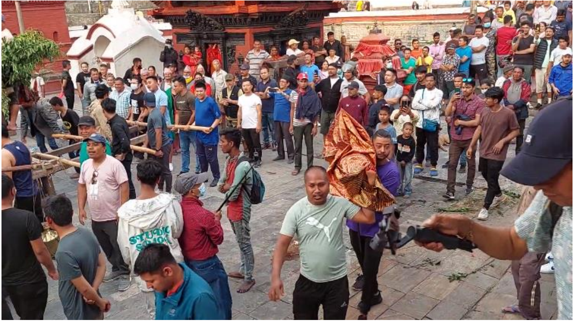
Figure 10 Hiding Kumar/Kumari from public by wrapping them with fabric