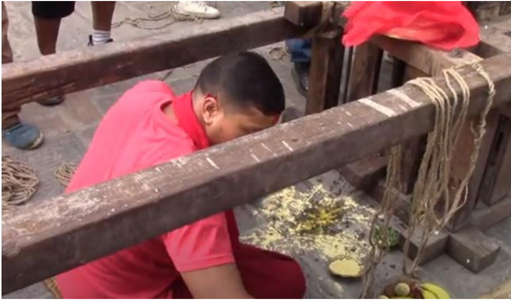
Figure 7 Worshipping chariot making a yantra by preist of Bhuvaneshwori