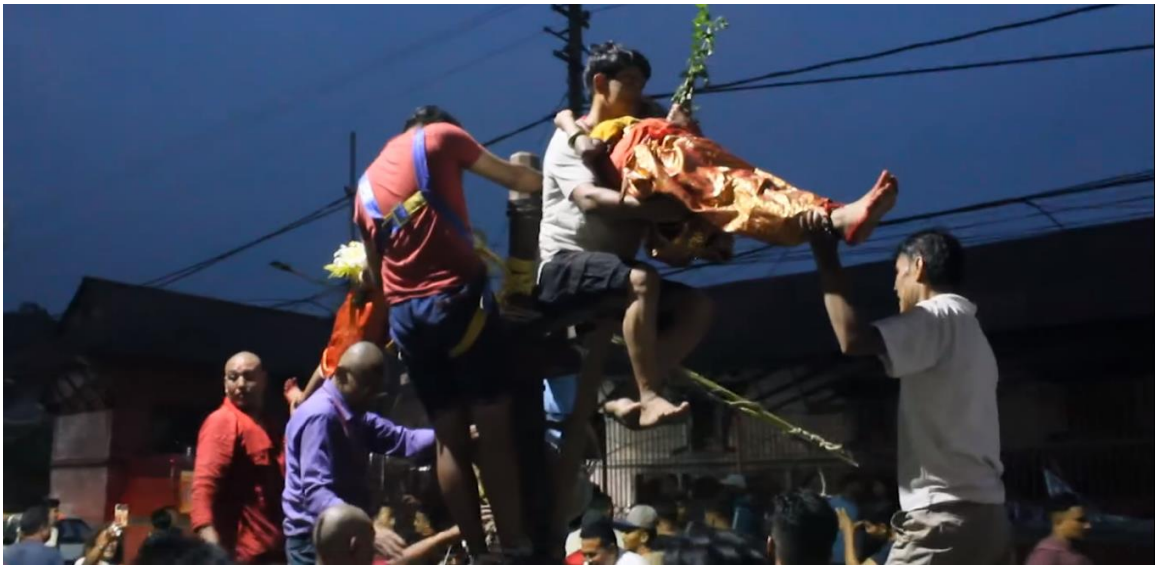
Figure 21 Two kumari of Jayabageshwori chariot brought down at the end at Bajraghar