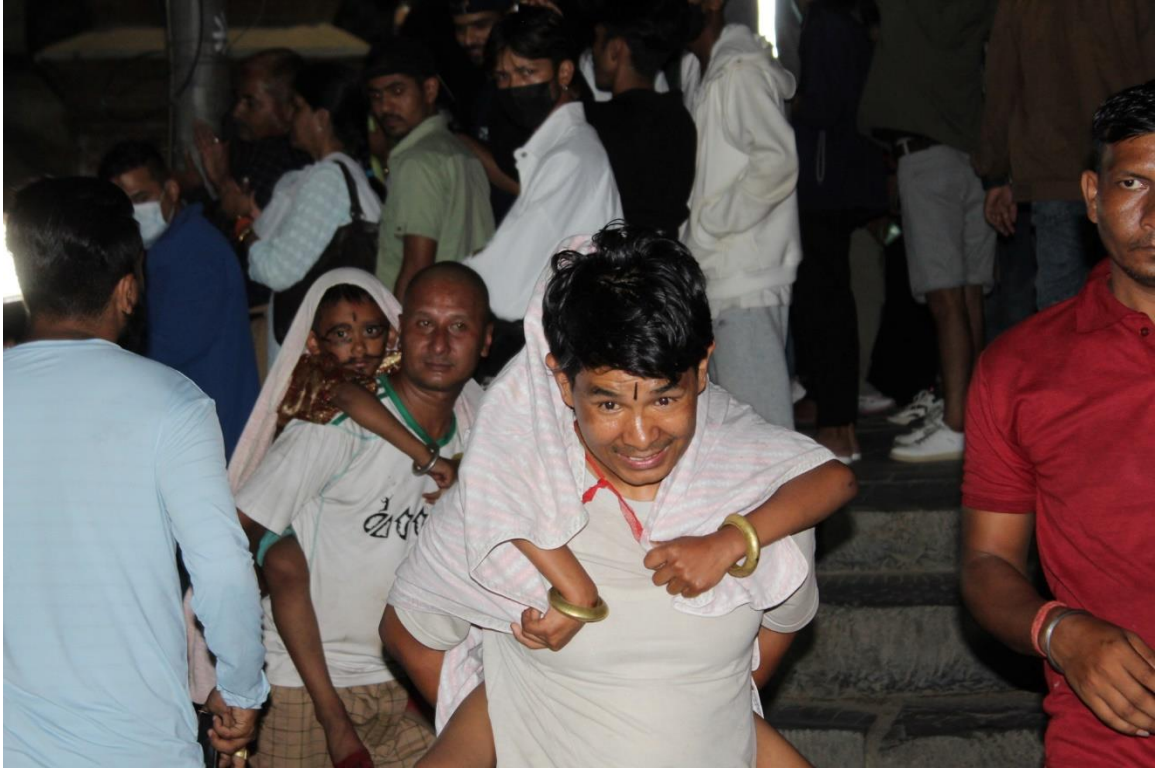
Figure 22 After putting the children down, covering them and taking them to Bagmati river