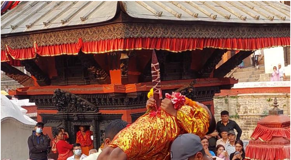
Figure 12 Iron spear attached to Kumar's stomach, representing a trident