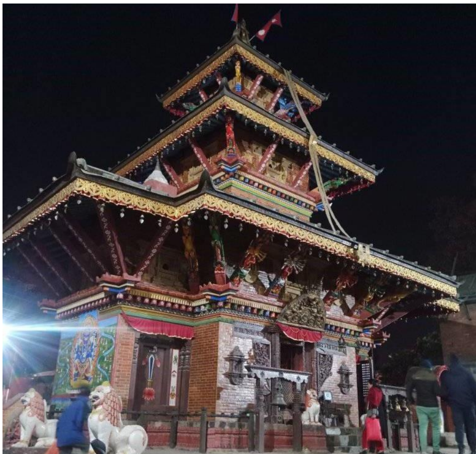
Figure 4 Jayabageshwori Temple