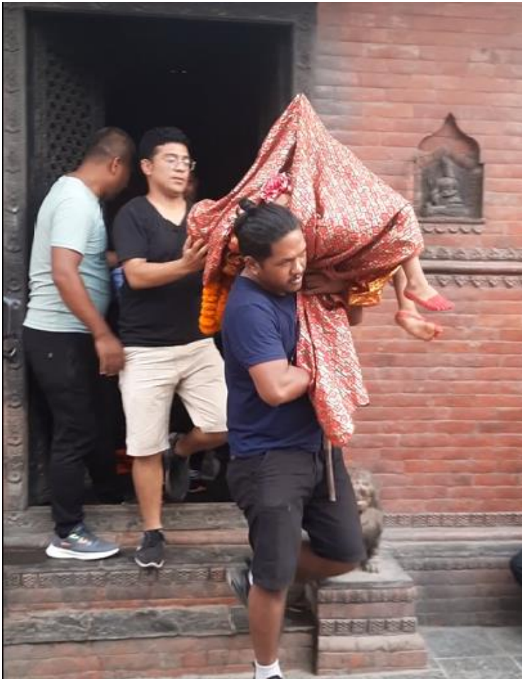
Figure 8 Bringing kumar from Mangala gauri temple to be kept on the chariot