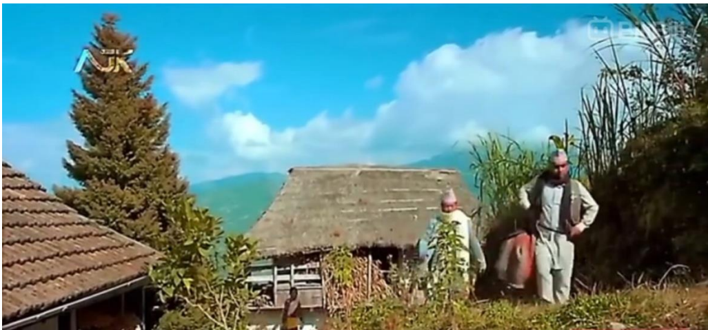
The woman chasing them while they are in search of new bride.

sometime ago she was the one who was trying to convince Hangma to stay with the husband but now when the situation is worst, she is taking side of her daughter. Now she is showing her frustration on her son because he is busy in his stuffs and not paying attention towards the household incidents. Actually, he is not aware of the current situation. The director/writer is presenting two different circumstances of the life. First is Hangma who is kind of bold and silent character who doesn't speak too much but does actions so loudly and she never regrets on it. Her all decisions are taken by herself. She never asks any help from other. On the other hand, male character Namsang has difficulties. After rejection of his own wife, he gets stuck in male ego. He wants to show Hangma that he is happy and will get new wife soon. There are many supportive characters to help him to find a new wife but search everywhere but they are failure to do so.