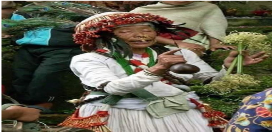
Female Nachhon Performing Ritual

rituals there is no objection by male. These practices bound Kirant female towards own culture and celebrates rituals with great happiness.