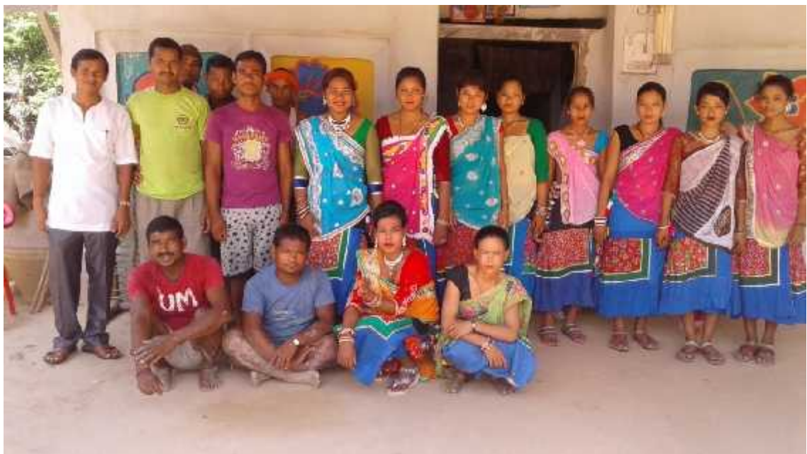
Group photograph 2: Tapa, Ghodaghodi Municipality11, Kailal