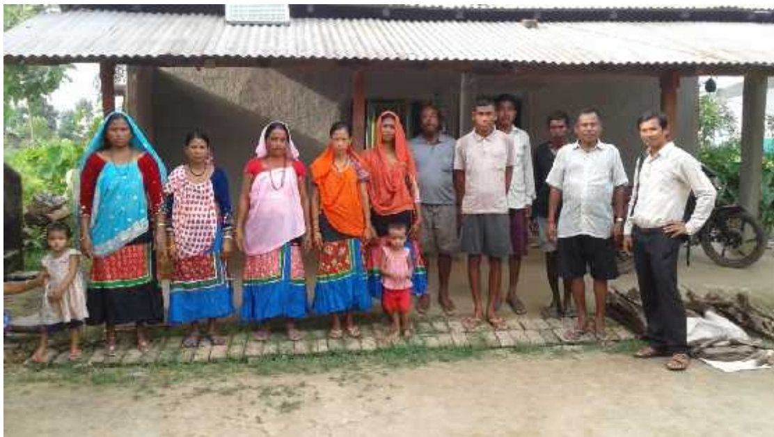
Group photograph 4: Kota, Ghodaghodi Municipality 12, Kailali.