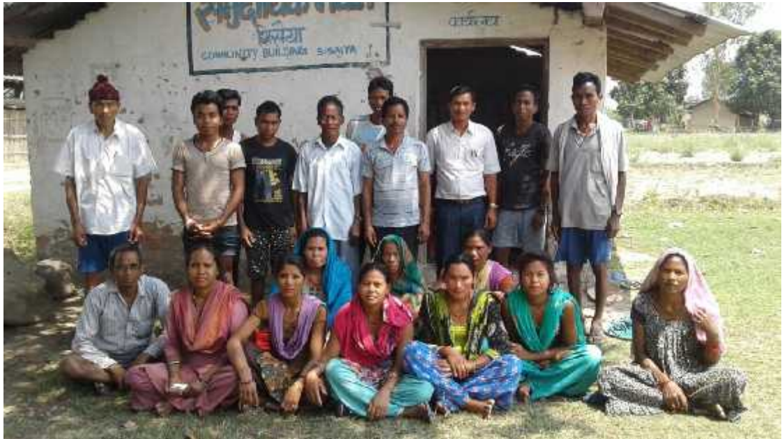
Group photograph 1: Sisaiya, Ghodaghodi Municipality11 , Kailali.