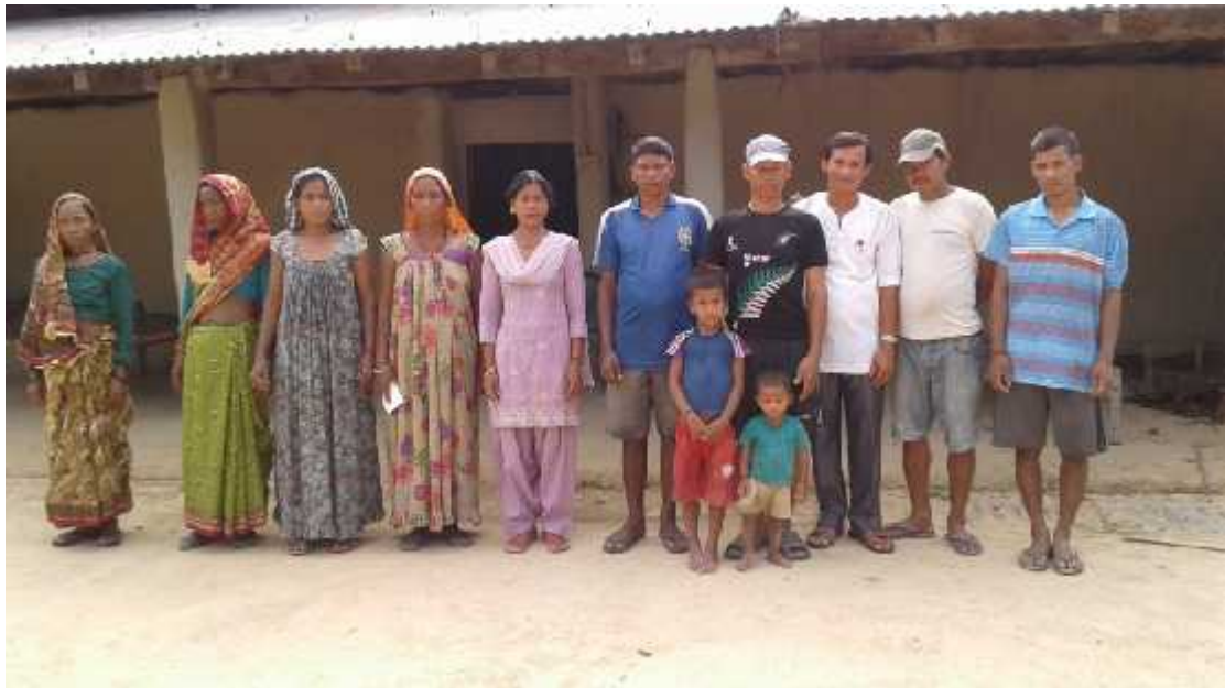
Group photograph 3: Jabalpur, Ghodaghodi Municipality 11, Kailali.