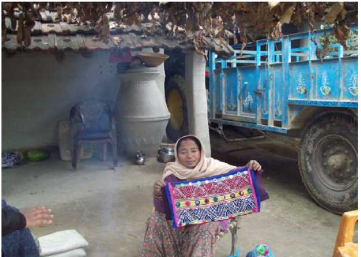
Photograph 1: A kathariya women displaying Nahanga.