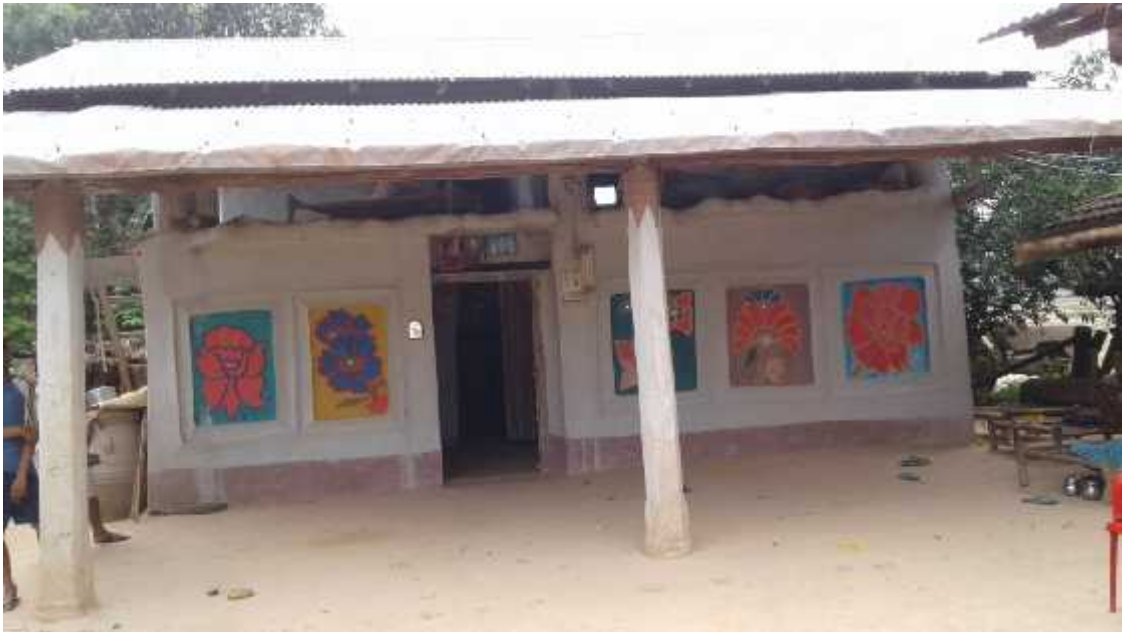
Photograph 2: A house with traditional paintings in Tapa, Ghodaghodi Municipality 11

Photograph 2 Presents a house with traditional paintings in the Kathariya speech community.