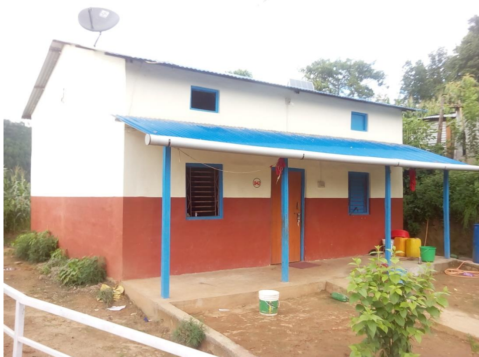
Post-earthquake modern house of Tamangs at Giranchaur