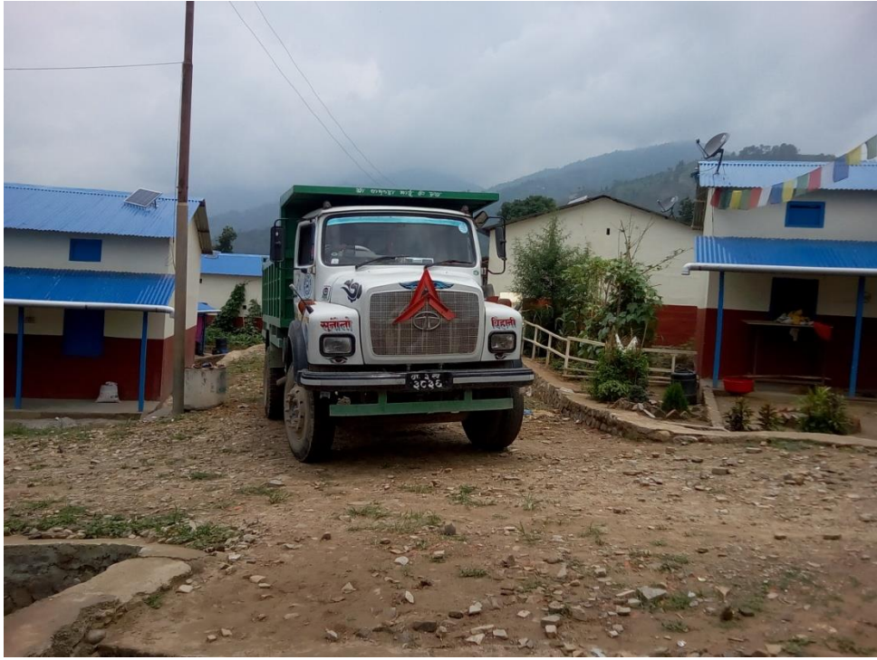
A Vehicle Approached in Post-earthquake Integrated Settlement