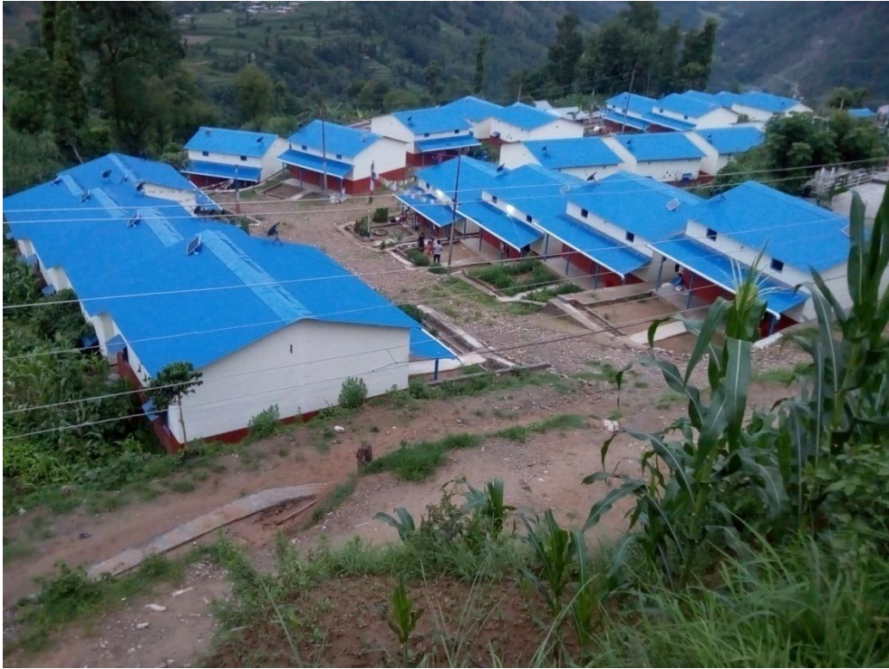
Post-earthquake Giranchaur Integrated Settlement