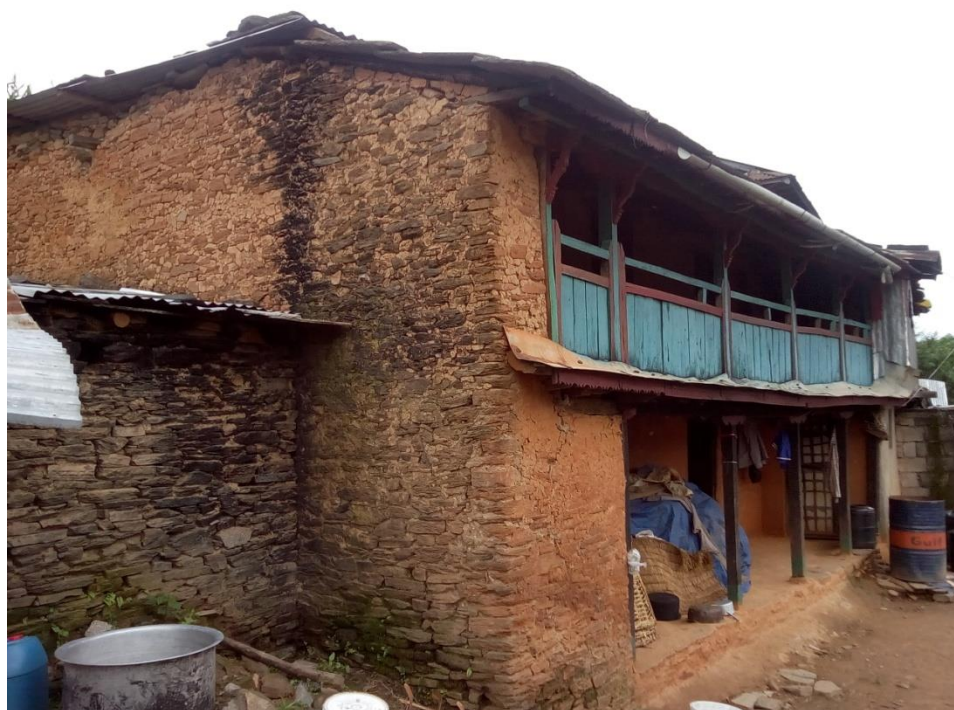
Pre-earthquake traditional house of Tamangs at Giranchaur