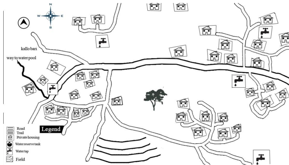
Figure No. 2. Map of Pre-earthquake settlement

The main entrance door of the house was directed towards south and gable end wall of houses were directed towards the east and west direction of entire houses of settlement before. Cattle shed were built just next to the house where they raised goats, buffalo, and bulls. They possess land which is downward to the settlement.