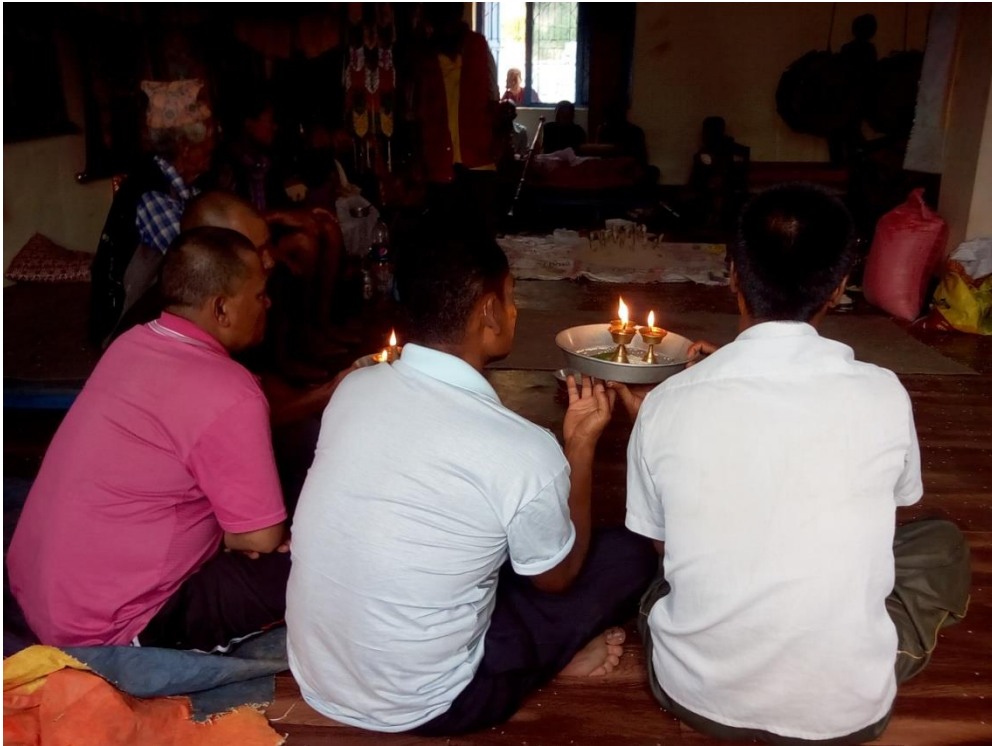
Death Ritual in Community Hall