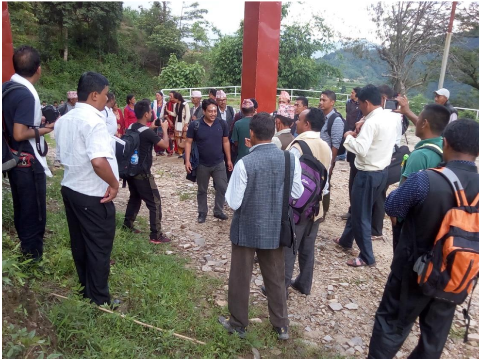
Visitors tours in settlement