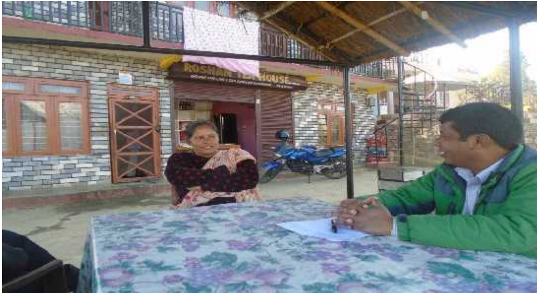
Interview with respondents