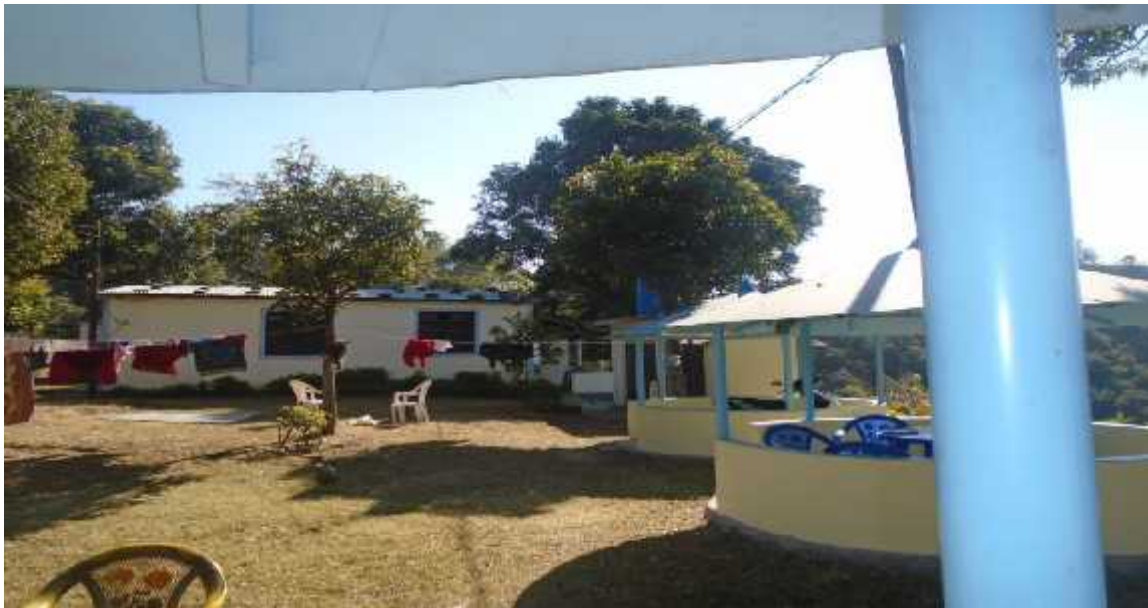
Structured House of Home Stay