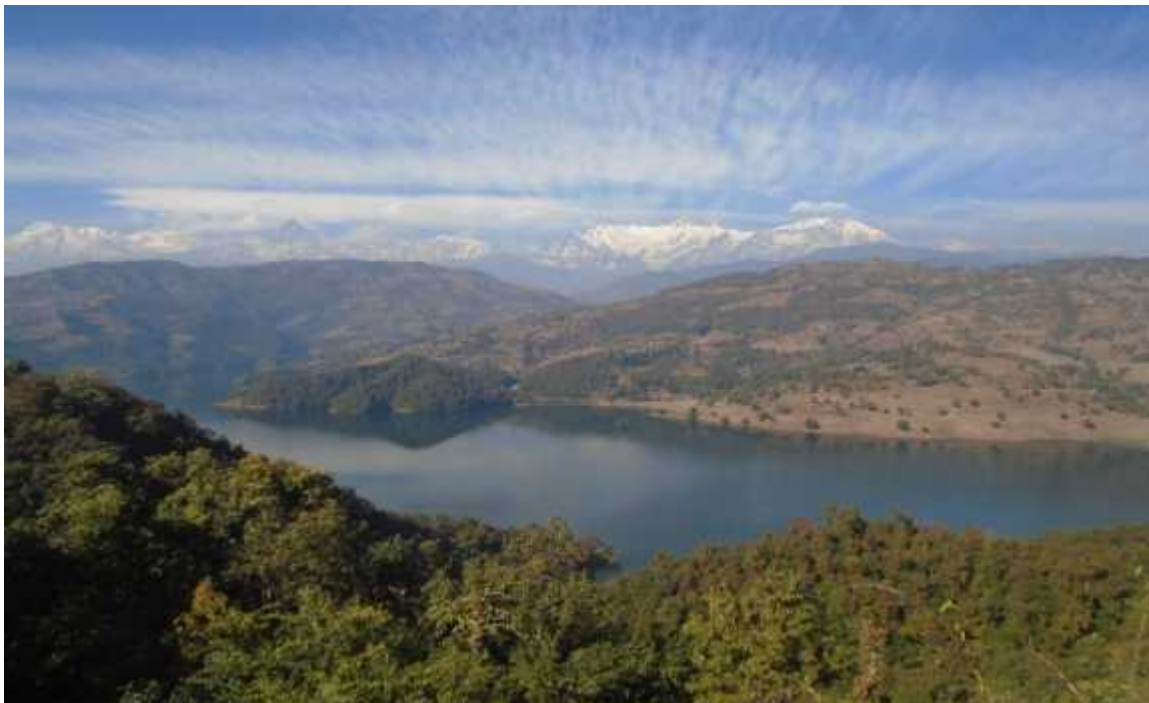
Study Areas' Lake