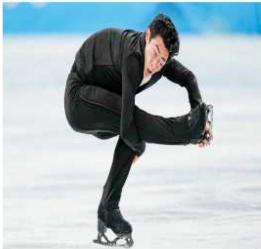
Triple world champion Nathan Chen needs to hold off Japanese rivals Yuma Kagiyama and Shoma Uno in Thursday's free skate to win gold.

American-born Ellen Gu struck back at her many critics by winning the gold medal in the debut of freestyle