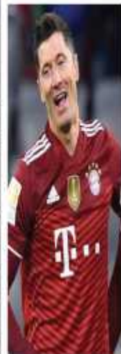
Robert Lewandowski has scored 24 goals in 21 games in Bundesliga this season.

Swedish forward Emil Forsberg had a chance to squander with eight minutes remaining but was denied by Bayern's goalkeeper Manuel Neuer.