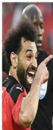
Mohamed Salah scored the equaliser and created the winner in Egypt's victory.

The Pharaohs defeat Morocco 2-1 while the Teranga Lions see off Equatorial Guinea 3-1 in the African Cup of Nations.