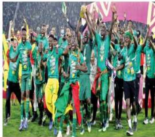
After two previous final defeats, Senegal are winners at last while Egypt missed out on a record-extending eighth continental crown.

Egypt had already twice won finals that had been settled on penalties after