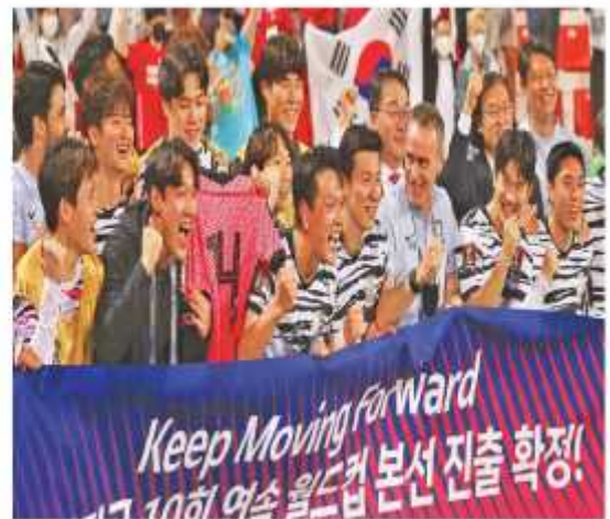
South Korea, who join Iran in confirming their place at November's finals, have appeared at every World Cup since Mexico in 1986.

The defeat ended China's chances of qualifying for the World Cup for only the second time.