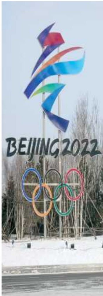
Beijing Olympics 2022 have been overshadowed by human rights concerns, the Covid-19 pandemic and over fears about Chinese government snatching of athletes.

China and the IOC hope that the success that has dogged the build-up will be relegated to the sidelines once