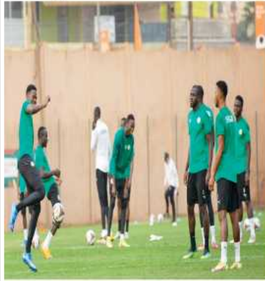
Senegal, who lost the title decider to Algeria two and a half years ago, are playing their third final in the Africa Cup of Nations.

The Lions of Teranga face the record seven-time champions Pharaohs in Sunday's final.