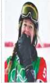
Lindsey Jacobellis won gold in her fifth Games, and also became the oldest US woman to win a medal at Winter Olympics.