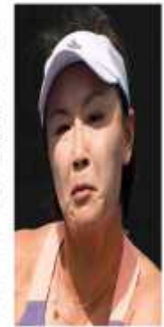
The International Olympic Committee on Monday said its president Thomas Bach dined with Peng Shuai on Saturday.

The IOC also wanted Monday to defuse the situation. It said Bach dined with Peng on Saturday, a day after Chinese President Xi Jinping opened the Winter Olympics. The IOC said Peng also attended the China-Norway Olympic curling match with IOC member Kirsty Coventry of Zimbabwe.