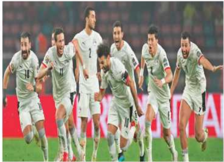
Egypt (pictured) and Senegal have also been drawn to play each other in a two-legged World Cup qualifying play-off in March, with only one making it to the finals in Qatar later this year.

completely different. It would be the closest one to my heart," Salah said earlier in the tournament.