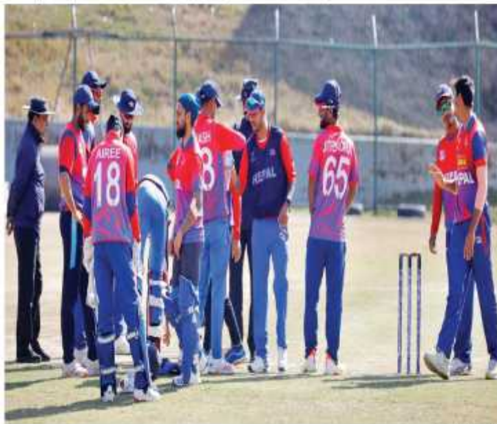
Nepal (pictured), hosts Oman, Canada and the Philippines are in pot 2 while Ireland, the United Arab Emirates, Germany and Bahrain in pot 1. The finalists will advance to the November finals.

A revamped Nepali team will fly to Oman targeting a place in the World Twenty20 finals for the first time since 2014.