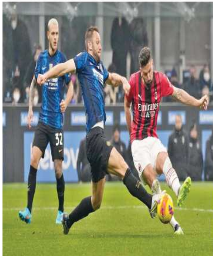
AC Milan's Olivier Giroud (right) scores his side's second goal against Inter Milan at San Siro on Saturday. His goals also ended the champions' 16-match unbeaten streak in the Serie A.

The France striker scores twice in the space of three minutes in the Rossoneri's 2-1 victory over leaders Inter Milan.