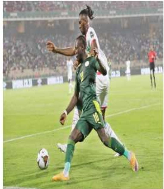
Sadio Mane's (foreground) Senegal have for years carried the unwanted label of being the best team in Africa to never win the Cup of Nations.

While Senegal have another chance at that elusive title, Burkina Faso have now lost a final and two semi-finals in the last five African Cups.