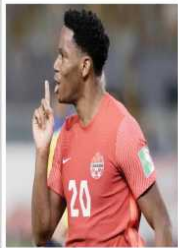
Canada's Jonathan David celebrates his goal against El Salvador on Wednesday. Unbeaten Canada are within touching distance of their first World Cup appearance since 1985.

Elsewhere Wednesday, Costa Rica kept their qualifying hopes alive with a 1-0 away win over Jamaica in Kingston. The victory leaves Costa Rica in fifth with 16 points, just behind Panama (17 points) following their defeat to Mexico.