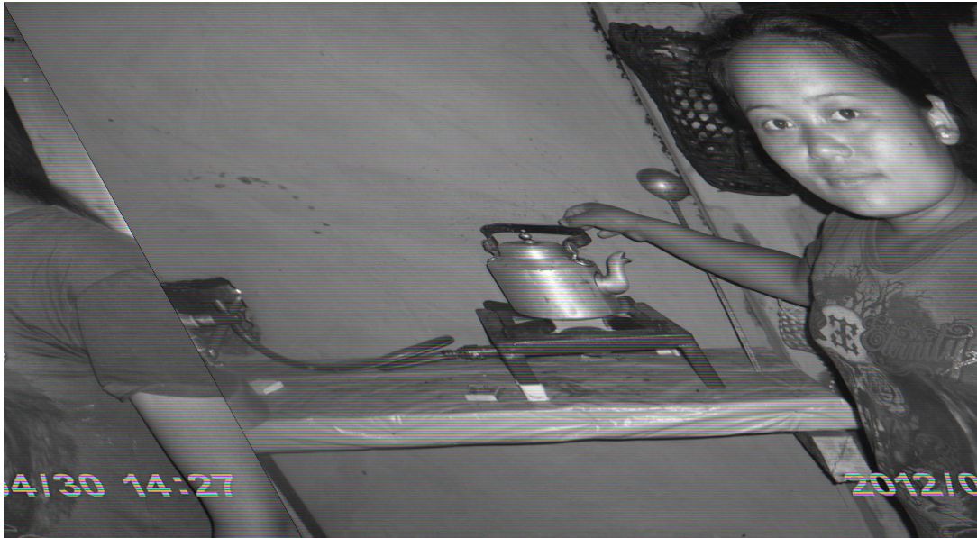
Boiling water in Biogas stove