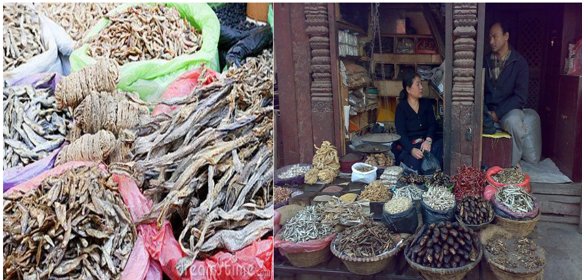
Photograph 5. Dried fish sold in Kathmandu

The people of Kathmandu city preferred fresh fish as well as dry fish. Local newari people of Kathmandu were frequently using smoke fishes as token of auspicious item and offered during birth day, marriage, bhai tika etc. So, demand of smoke fishes was very high during Dashain, Tihar and throughout winter (marriage season). Besides, sundried fishes were also used to prepare different typical item like ‘Sanya Kunya’ in winter and pickles. In Narayanghat, especially Malekhu and Mugling were famous for smoke dried chadi fishes of local rivers and locally prepared fillets to be taken mixed with vegetables.