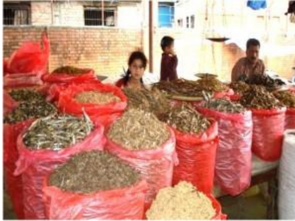
Photograph 4. Dry fishes