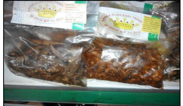
Pickle of Dry Fish