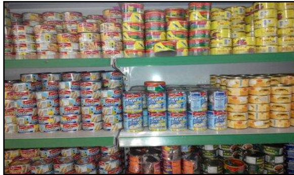
Thailand Brand TUNNA Canned fish