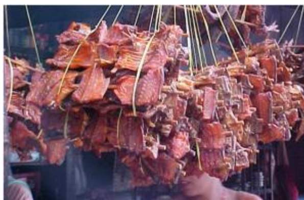
Fish sun-drying (Nepal)