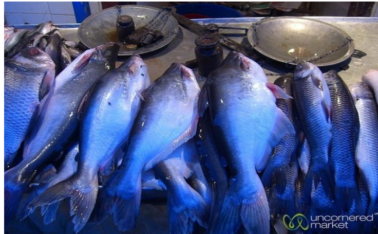
Photograph 1. Fishes sold in the market.

number of tourists are becoming a more and more important factor in the marketing scene, as the tourist trade in Nepal is expanding rapidly. A similar situation with regard to fish supply can be observed in other centers of Nepal such as Pokhara, Narayanghat, Hetauda, Janakpur and elsewhere.