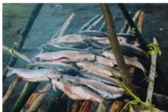
Fish smoking (Nepal)

Sometime fishermen captured fish in quantities beyond what could be marketed in fresh form. In order to preserve extra fish from spoilage, smoking and sun-drying were the methods practiced. Fishermen used to smoke fish in the fishing spot. Generally, such methods of preservation applied to high value and big fishes such as Bagarius yarrelli , Tor putitora , Neolissocheilus hexagonolepis , Chagunius chagunio . It worth mentioning the dried fish represented about 25% of total fish sale. The price of dry fishes was 4-5 times higher for dried smoked fish.