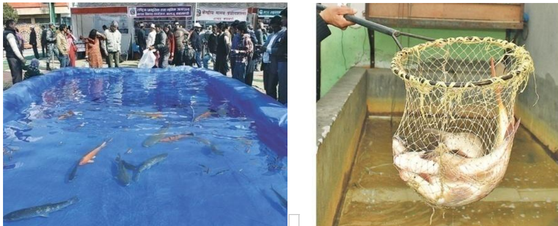
Photograph 2. Live fishes sold in Kathmandu.

Live fishes from Bara and Chitwan district were available in Kathmandu at different places like Balkhu, Ratopil, Bhaktapur and new Baneshwor for sale. Live fish sale accounted around 10%. The Kathmandu valley had more than 38 outlets selling live fishes. Prices of live fishes fetched high due to difficult to keep alive. Prices of different fishes in the markets like Catla catla (Bhakur) ranged at about Rs.600/kg and fishes like Rohu , Ctenopharyngodon idella (Grass carp), Cyprinus carpio (Common carp) ranges about Rs. 450/kg. According to President of Fishery Association of Nepal, 800 – 1000 kg of live fish were sold from Balkhu Vegetable Market. Four water tanks had been set up in this market to house live fishes. Except Saturday approximately 40-50 kg per day fishes were sold out whereas on Saturdays 100 kg fishes were sold.