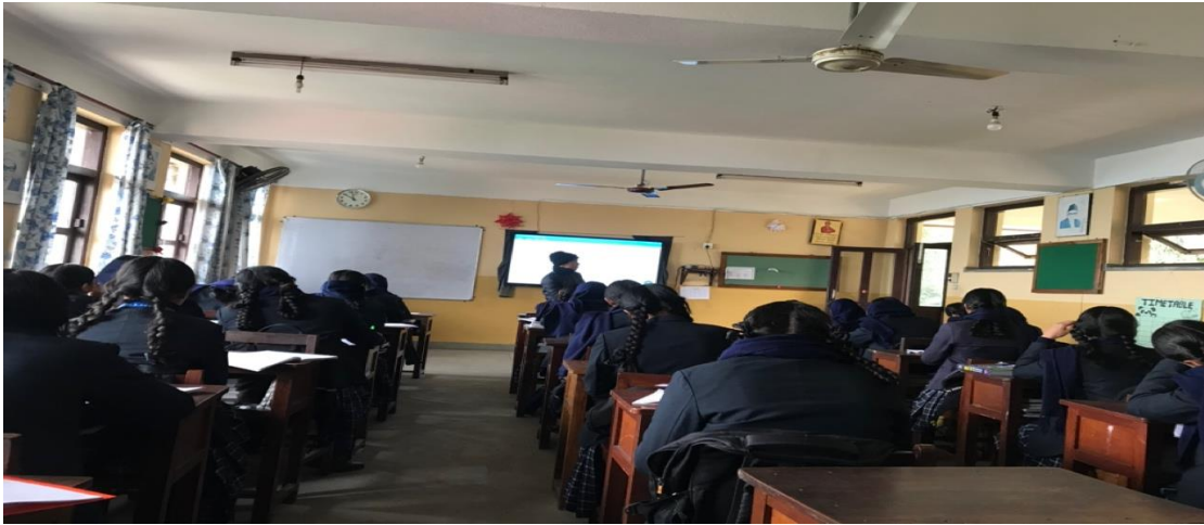
Figure 4: the teacher is teaching in the classroom (Classroom Observation)