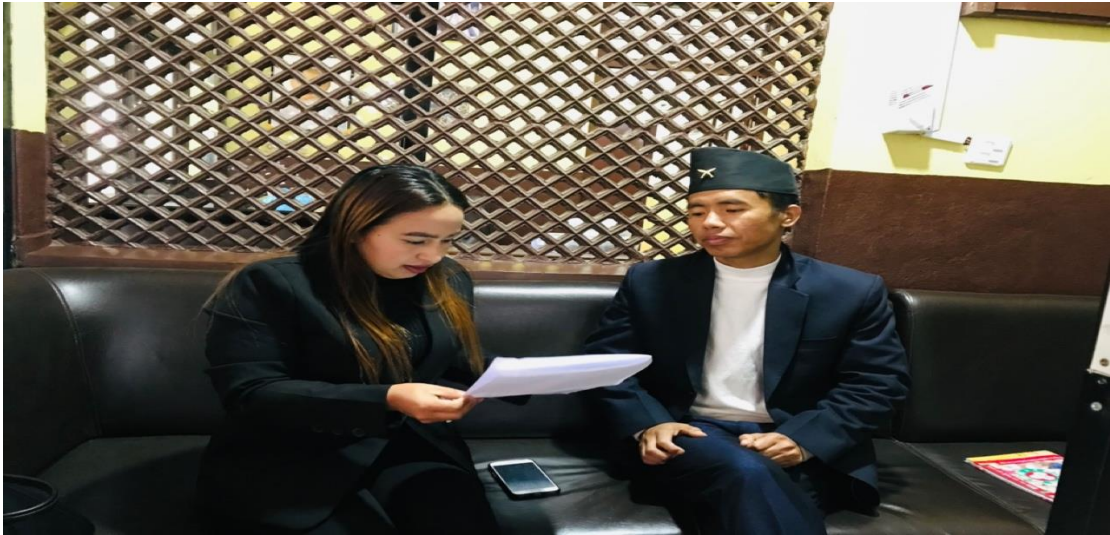
Figure 3: Interview with English Teacher