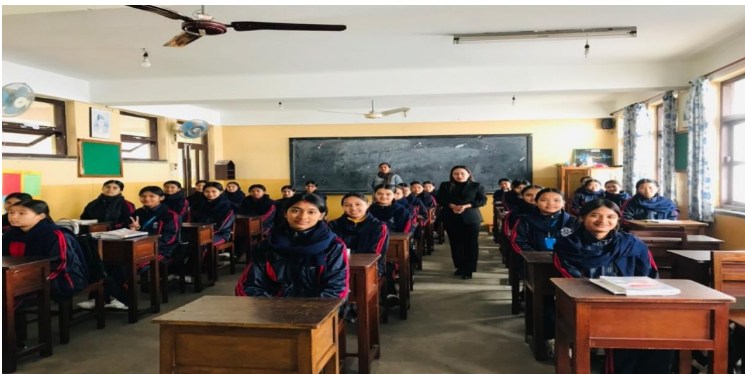
Figure 5: Nine class students, and all were girls.

In the same Case, I took interview with English Teacher, the teachers also shared about student engagement in ER “ I make sure that students are actively involved by encouraging them to choose their own reading materials, I also ask for their opinions and feedback on the materials we use. I also create environment where students feel comfortable and share their perspectives”. The teacher actively involves students by letting them choose their materials and seeking their feedback on what they enjoy. This creates a classroom culture where students feel comfortable and share their ideas. There is sense of excitement as students engaged and interact with one another, showed their involvement in the learning process.