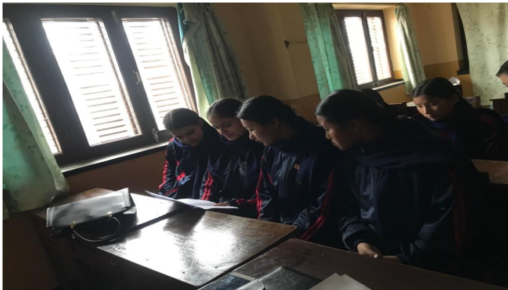
Figure 2: Focus Group Discussion (FGD)

In the same case, I took Interview with English Teacher, the teacher said“ I believe that the materials that I use in classroom or that I suggest for outside of the classroom are very useful and effective that students learn and use for building comprehension and vocabulary, novels ( To Kill mockingbird, The Giver, Animal farm, Wonder) helps improve fluency, they learn new word and use in their daily life which is related to real life story and event”. Teacher believed the materials used are very effective to learn and used new words in enhancing students understanding in comprehension and vocabulary. It means that extensive reading not only helped students but also enabled them to use naturally in their conversations and writings, and the teacher also helped them to read the materials that match their interest and level.