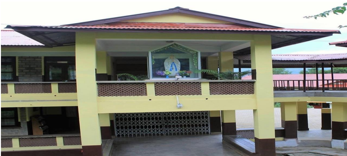
Figure 1: St. Mary's School Gorkha