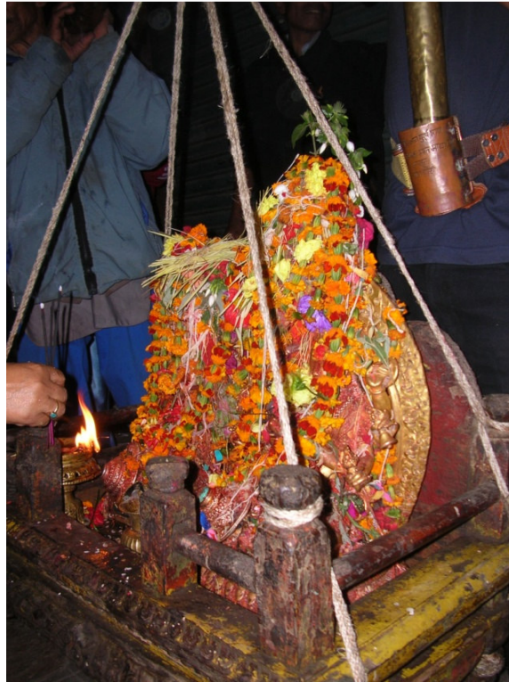
Fig.16 Mahalakshmi at Deema Khat during Chaturdasi