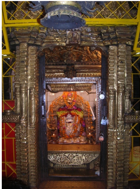
Fig.3 Picture image of kalash inside the main sanctum with carved embellishment on silver repoussage works on doorway