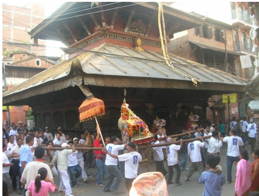
Fig.24 Annapurna Jatra on the way to Naradevi one of the Matrika of the valley during