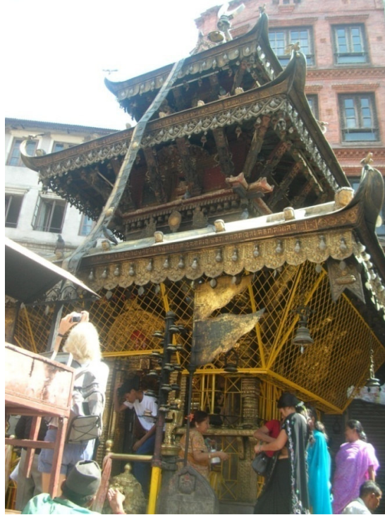
Fig.2 Temple of Annapurna Devi Southwest corner