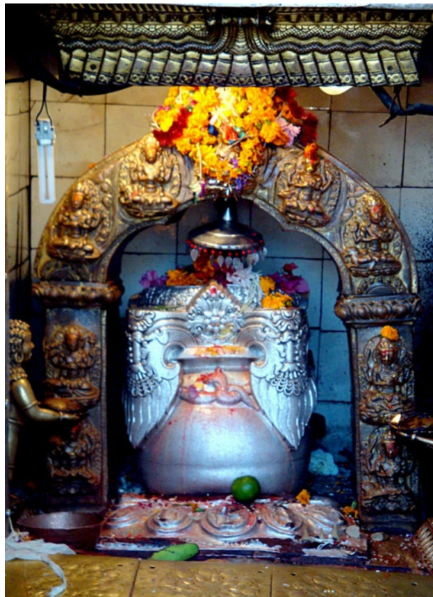
Fig.9 Inside the sanctum of Annapurna Temple showing Kalash Emblem and Astamatrika gana