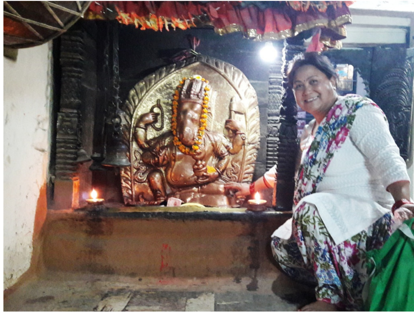
Fig.8 Image of Ganesh with temple inside Dyochhen at 2nd Floor facing south