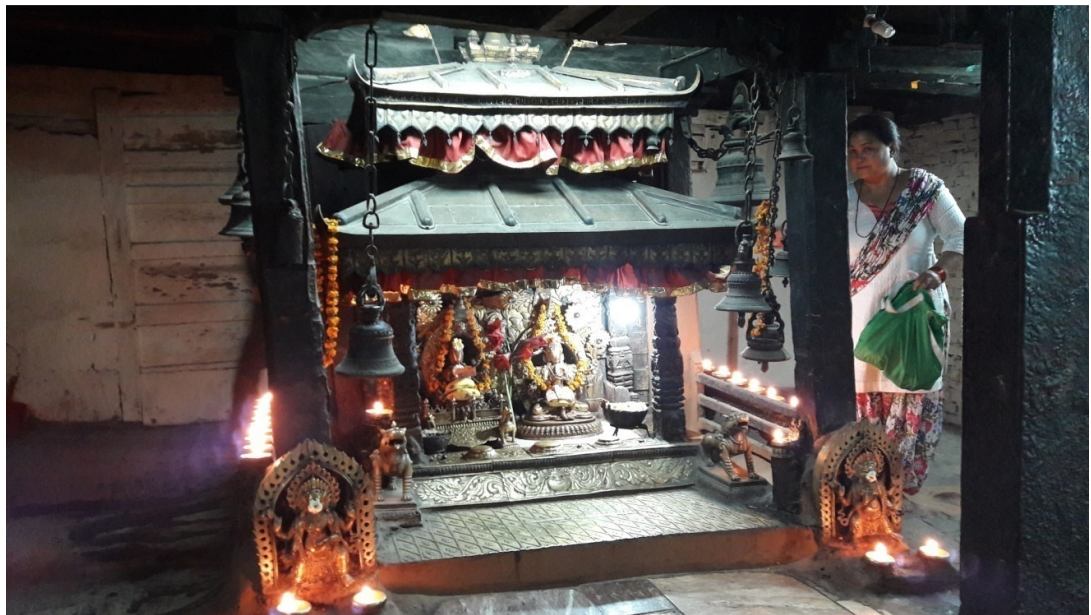
Fig.7 Temple of Mahalakshmi with Sculptures inside the sanctum of Dyochhen at 2nd Floor