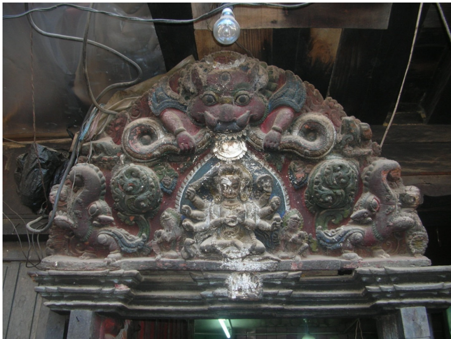
Fig.20 Wooden Tympanum ( Toran ) above the main doorway of Ita chappa