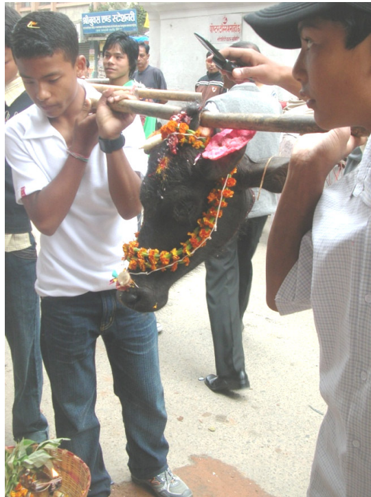
Fig. 15 Lasakusa Ceremony of sacrificed buffalo at the main entry of Dyochhen