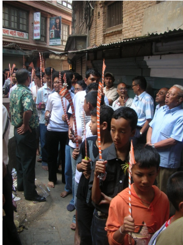
Fig.21 Paaya Jatra during Ekadasi by Tuladhar Caste at Annapurna Precinct