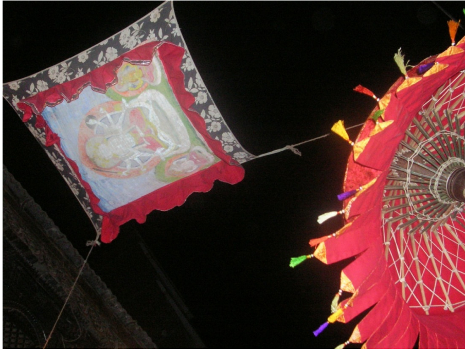
Fig.14 Picture showing Ilan above the main entry of Dyochhen with Poubha art of Devi during jatra. Right hand side is part of Aajuchhatra