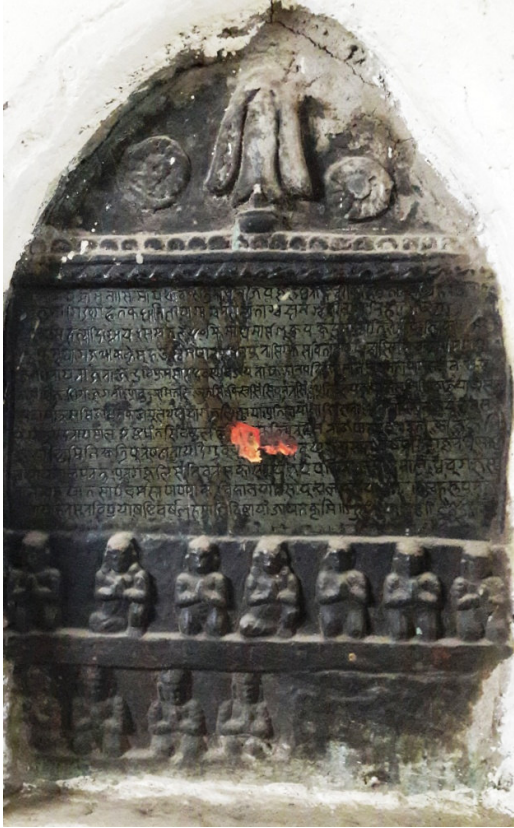
Fig.12 Stone Inscription clad against West wall at Dyochhen 2nd Floor dated 1876 BS