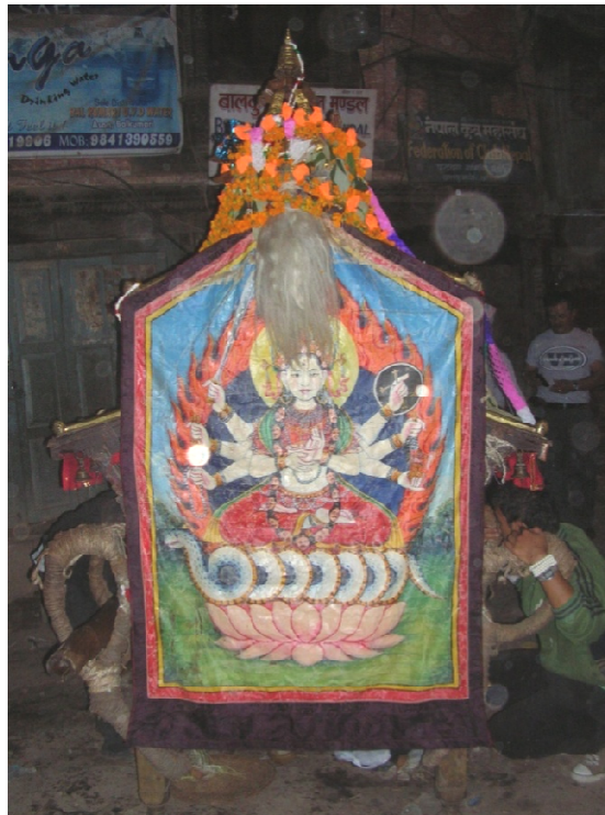
Fig.13 Poubha art of Annapurna at the backside of khat