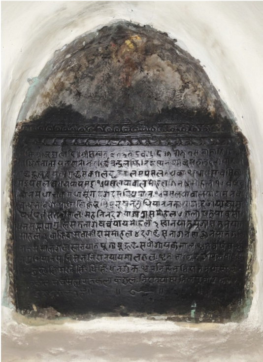
Fig.11 Stone Inscription clad against North West wall Dyochhen 2nd Floor dated 1910