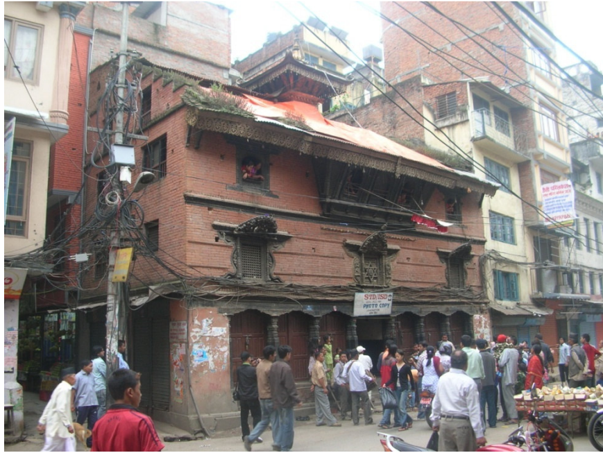
Fig. 4 Annapurna dyochhen from Northeast Corner