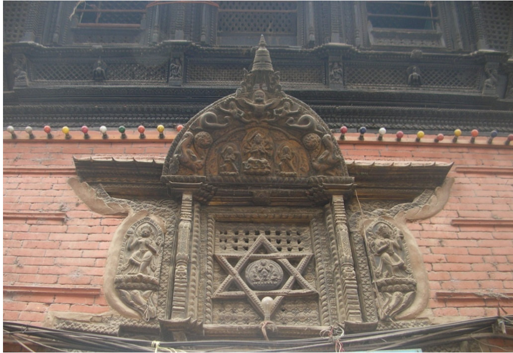
Fig.6 Decorative and symbolic Brass metal centrally positioned window with tympanum on 1st floor of Dyochhen