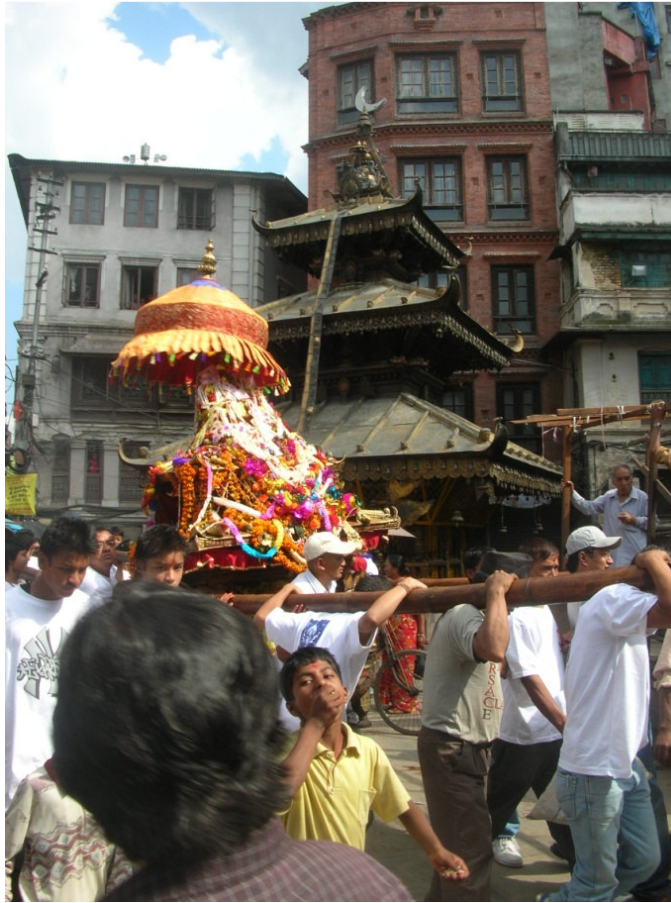
Fig.23 Khat of Annapurna Jatra at Annapurna Temple during Dwadasi