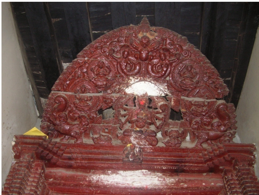
Fig. 5 Wooden tympanum at the main doorway of Annapurna Dyochhen which has enameled painting and two of the attendants has been stolen at each side of the Main Deity.