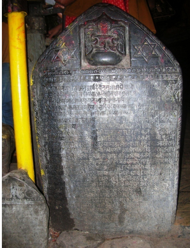
Fig.10 Stone Inscriptions on the left side of the main temple entry