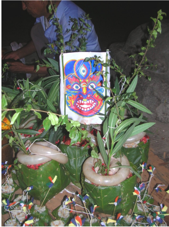
Fig.18 Feeding bwo khwa during dasami night after hom