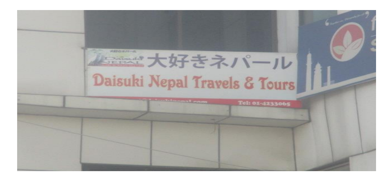
Figure No.: 13

The first LL related to translation was taken from Bagbazar area of Kathmandu district. In this advertisement, there was an advertising on translation. It describes the notary public center. Nepali English partial translation is used on this LL of advertisement.