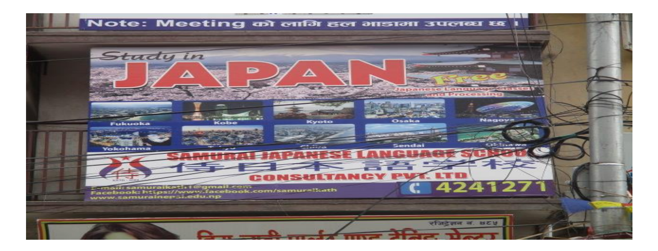
Figure No.: 19

These pictures are taken from Kirtipur and Bagbazar area from Kathmandu district. There were various pictures and signs included in the images of the language used in LLs.