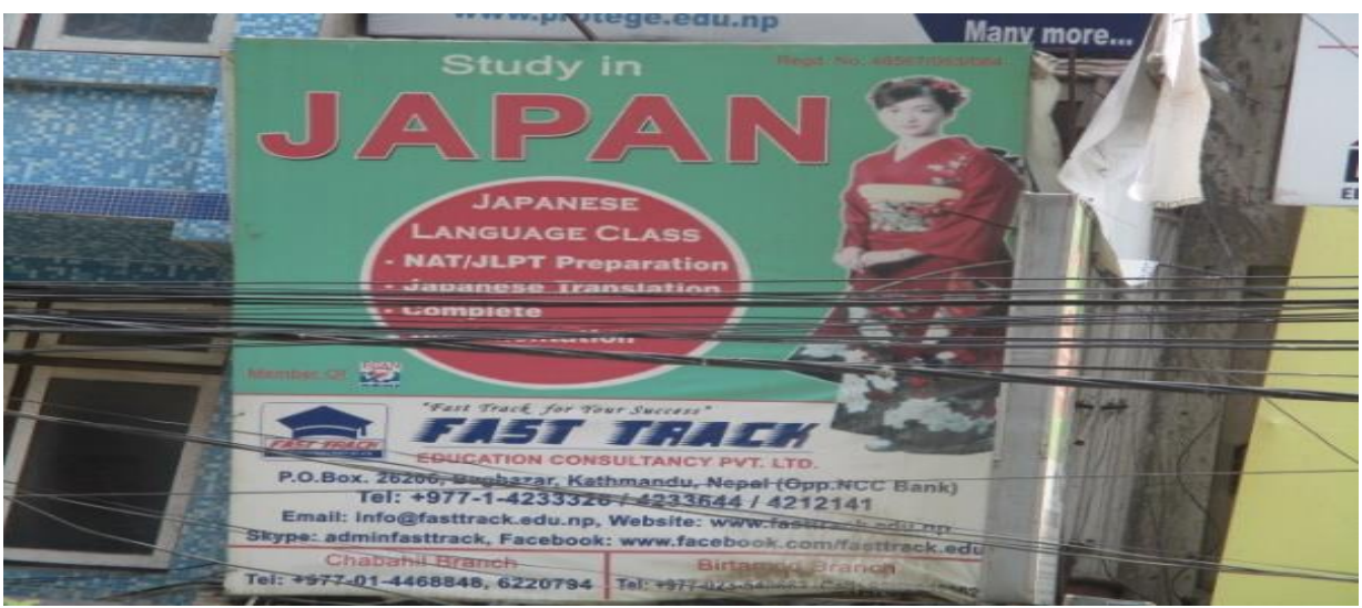
Figure No.: 18