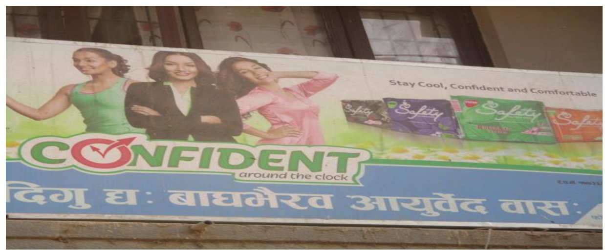
Figure No.: 17