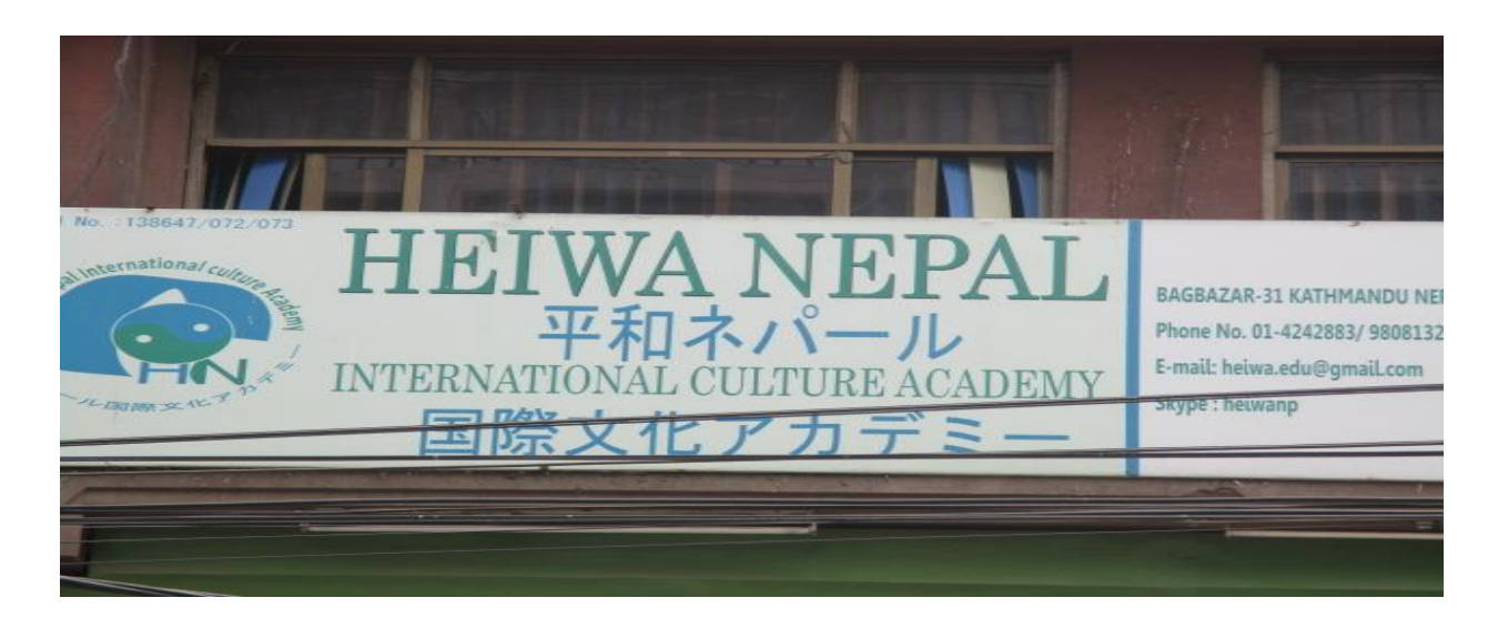
Figure No.: 12