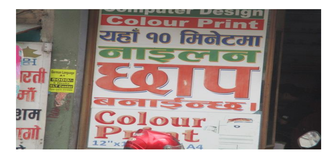
Figure No.: 6

These above-mentioned examples of the LLs are taken from kirtipur and Bagbazar area. These are related to bilingual. On the first LL, there is an advertisement which belongs to the information about women's pads and there are women's photos and pictures of safety pads. English and Newari languages are used for the advertisement on the LL. It describes the quality of pads and description of pads with English words as 'stay cool, confident and comfortable'. So, there are two languages used for the advertisement of the pad.