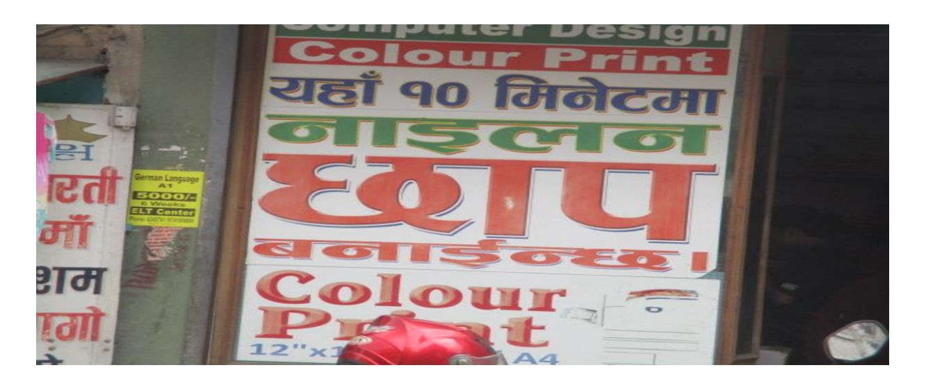
Figure No.: 15