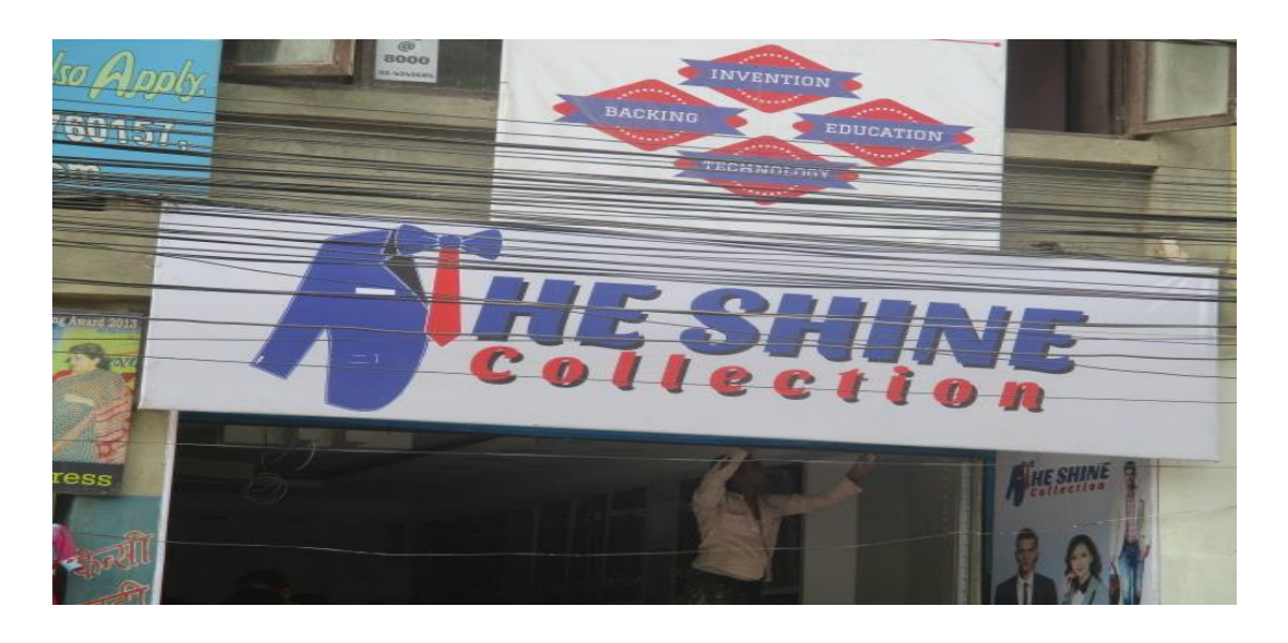
Figure No.: 3

These LLs were taken from Kirtipur and Bagbazar area. The first belongs to the advertisement of the cement company. On the advertisement, there was an advertising of Nepali cement. This advertisement is about Nepali cement product named 'United Cements'. It describes the quality of cement which is called O.P.C Cement. Similarly, there is a logo of the qualitative product of Nepal which is certified by the government of Nepal. On this LL, there was only one Nepali language used so, it was called Monolingual. So, only one language with transliteration was found on this LL of advertisement.