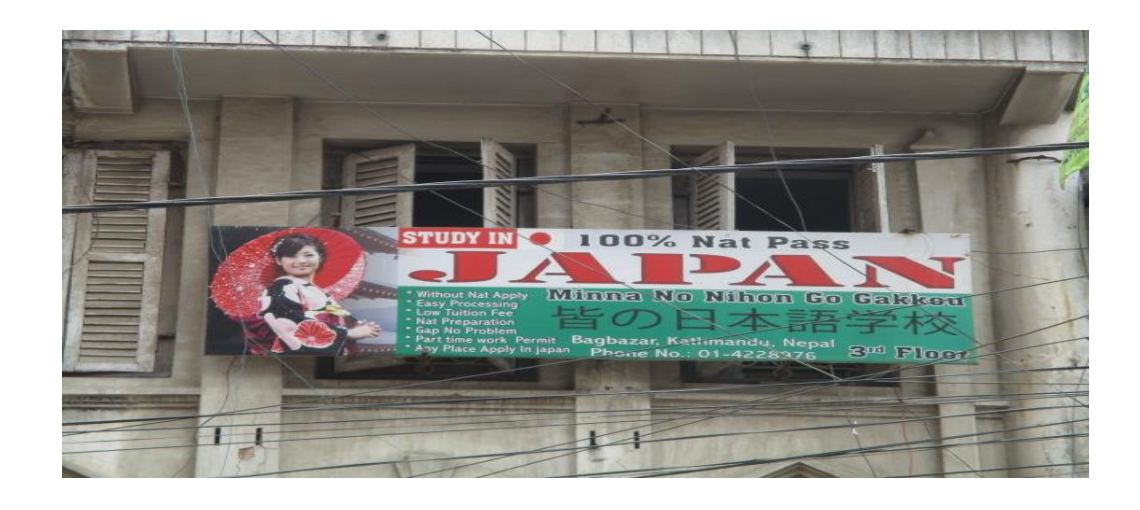
Figure No.: 5