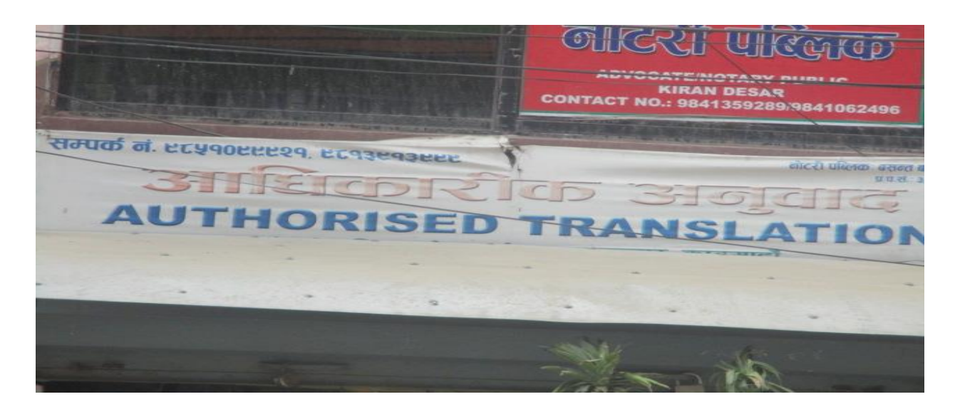
Figure No.: 11