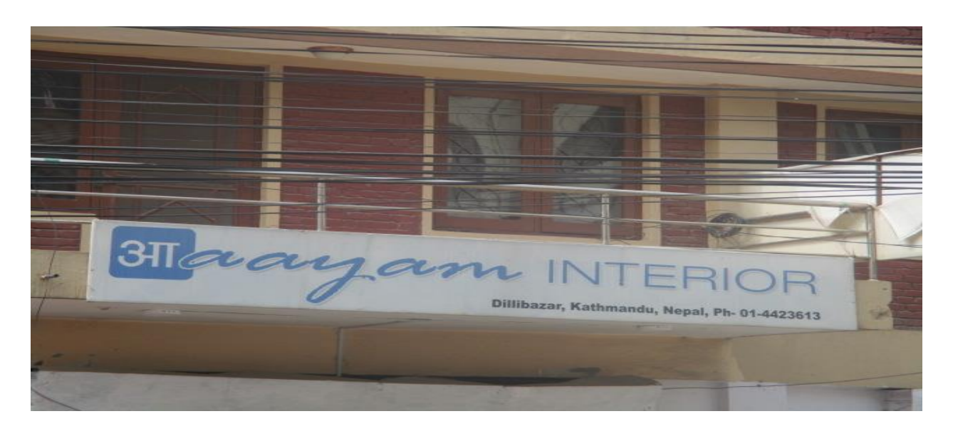
Figure No.: 14