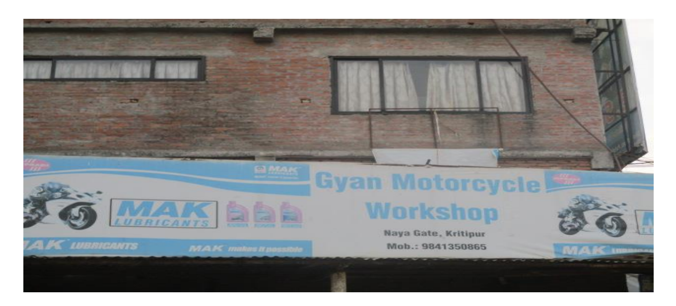
Figure No.: 8