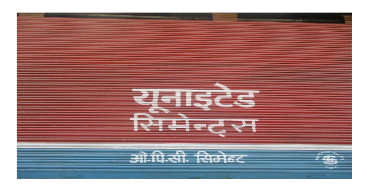
Figure No.: 1