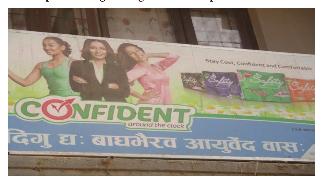
Figure No.: 4