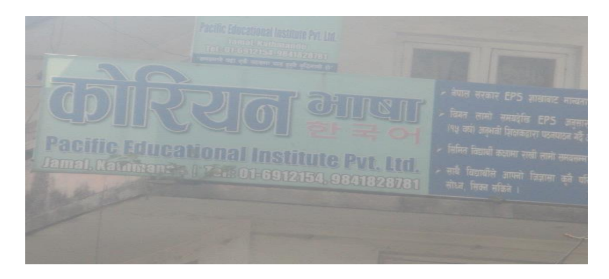
Figure No.: 7

This picture was taken from Jamal area of Kathmandu district. This is the advertisement of a Korean language class or institution. It describes the quality of language and institution. Similarly, it describes Nepal government EPS certified company. It focuses on the experience of trainers and institution. This LL of advertisement is an example of multilingual where English, Nepali and Korean languages have been used.