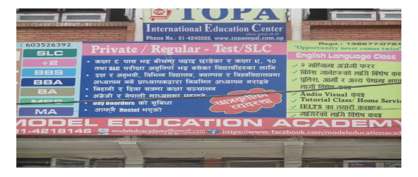
Figure No.: 16

The first LL based on code-mixing was taken from Dillibazar area of Kathmandu district. On this LL of advertisement, there were two languages used together. It describes the institution. Here, Nepali letter is used with an English letter to form the word. Nepali word is used with English word on the LL of advertisement.