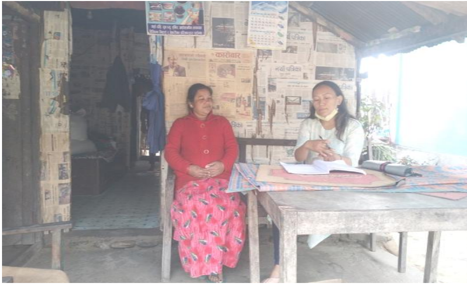
Researcher talking with the respondent while collecting data