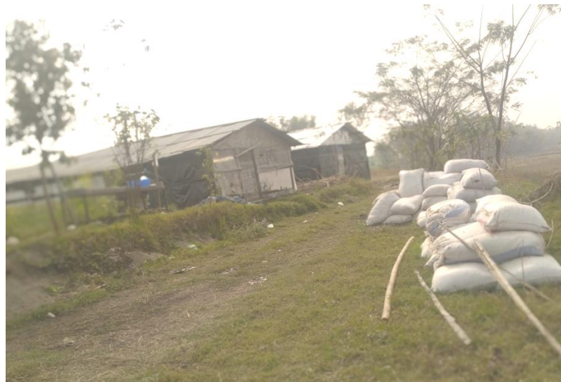
Settlement of the respondents