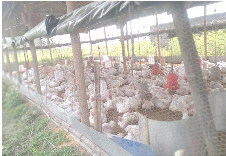
Poultry farm of the respondent