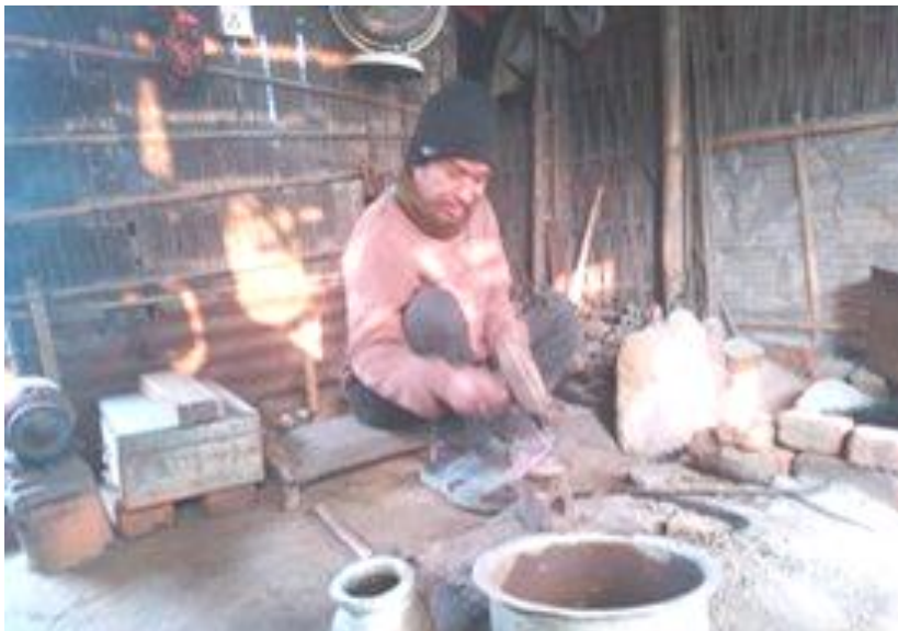
Traditional occupation of the respondent