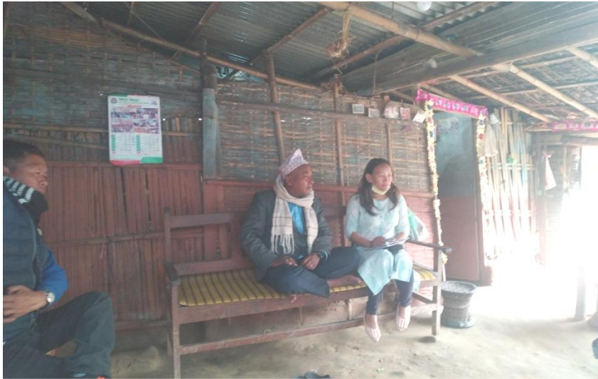
Researcher collecting data