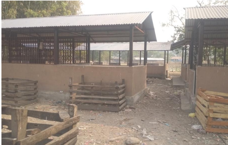
Pig farming of the respondent