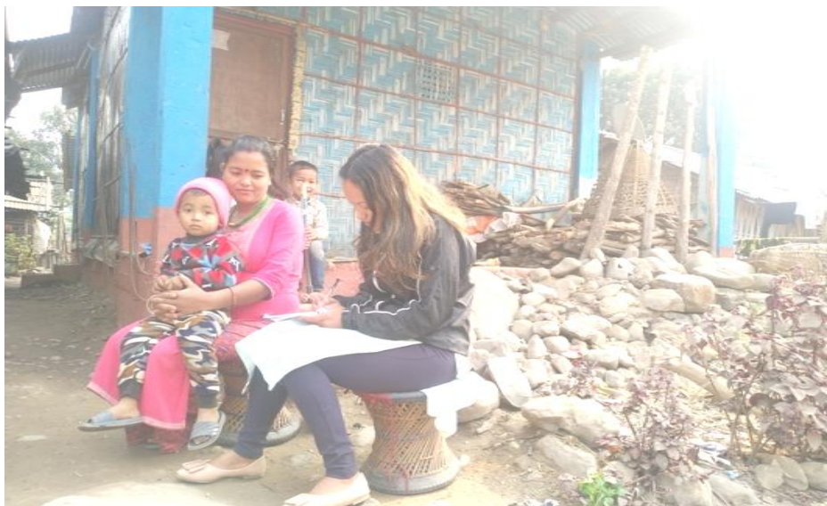
Researcher collecting data