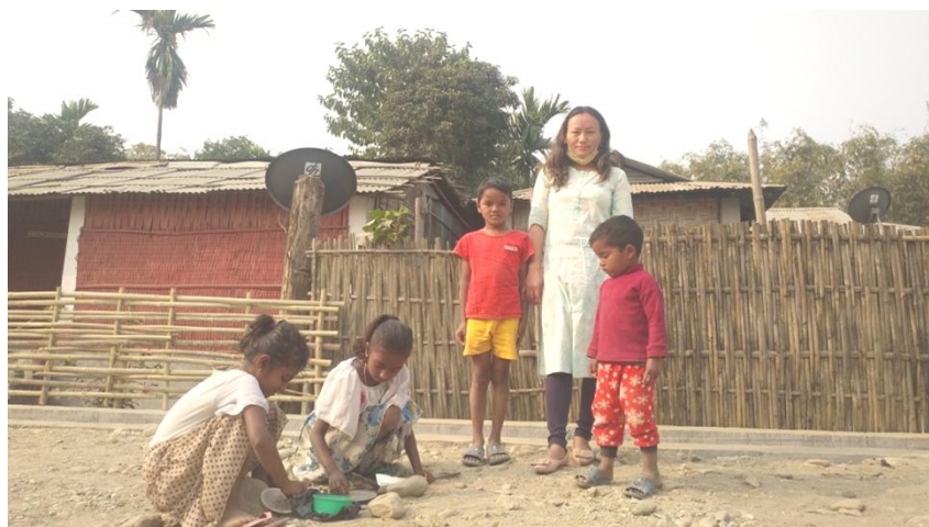
Researcher with the local children