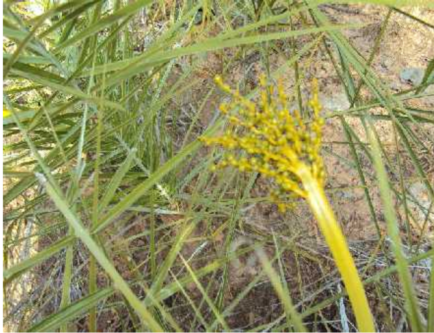
Thakal : an edible product of the BCF.