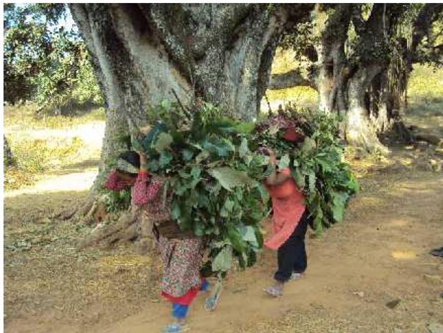
Two women taking fodder from the BCF.