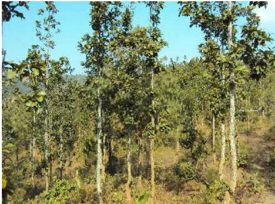
A sight of the BCF area.