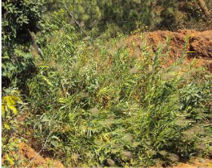
Amriso : one of the non timber forest products of the BCF.