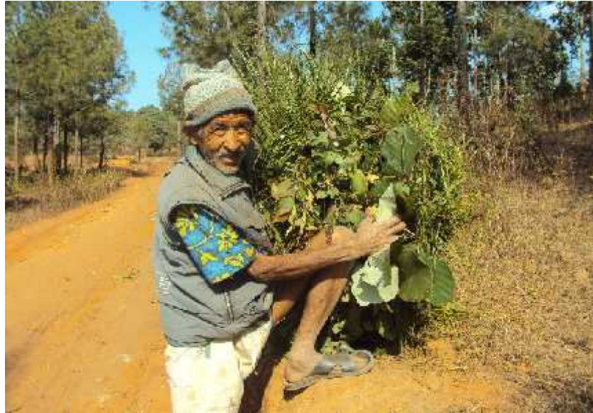
An old man with Thakal which is used for making roof.