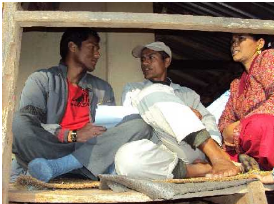
The scholar taking interview with respondents.