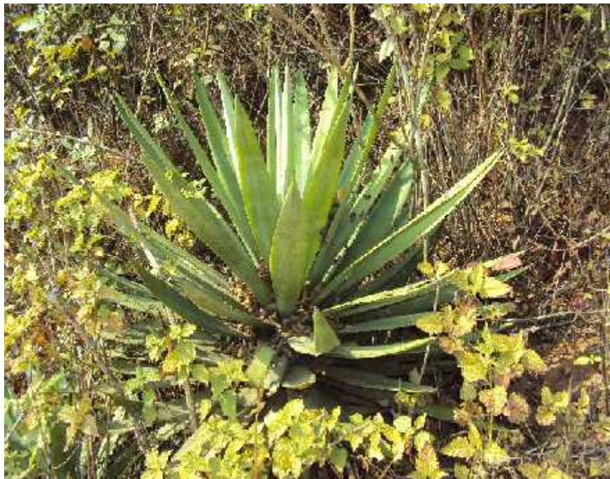
Kettuki : A plant that is used for making fiber.