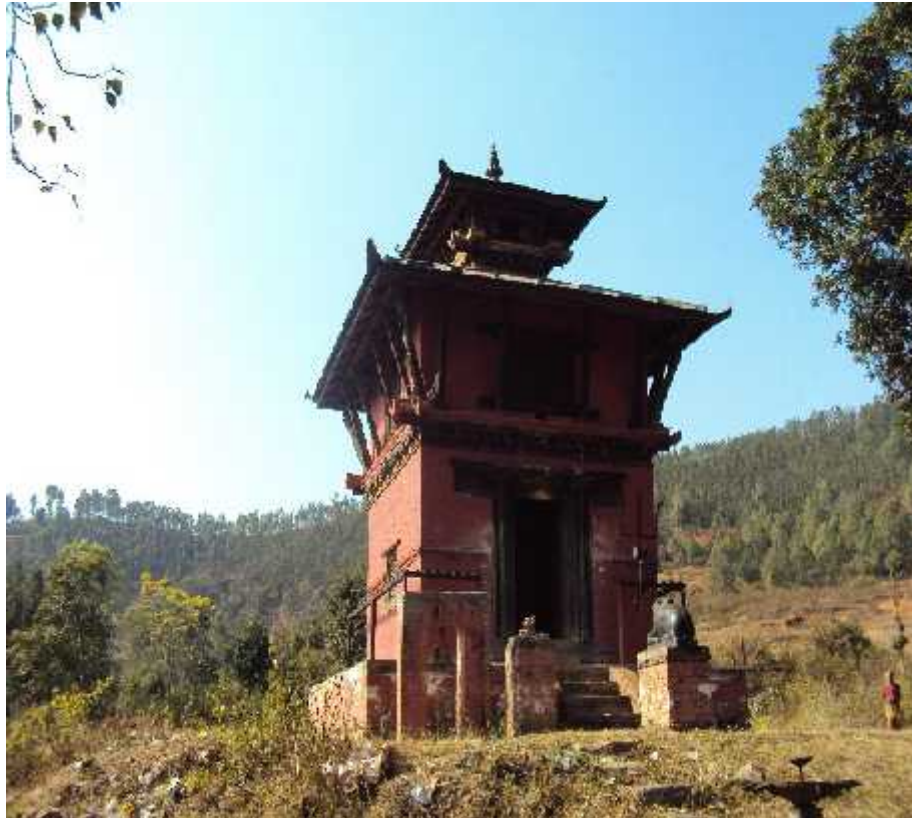
The temple of Dugdeshwor Mahadev situated inside the BCF area.