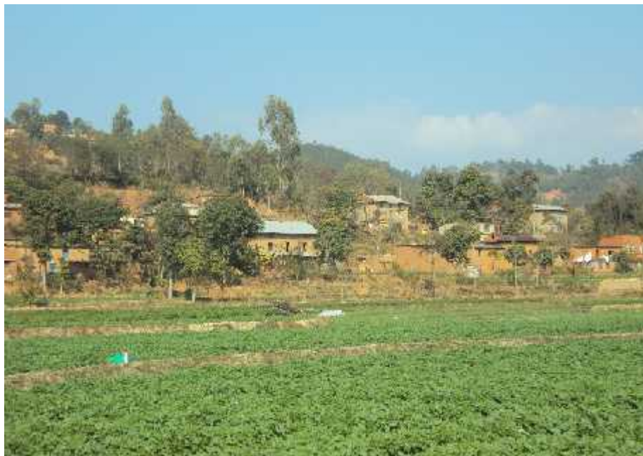
A glance of BCF consumers' settlement.