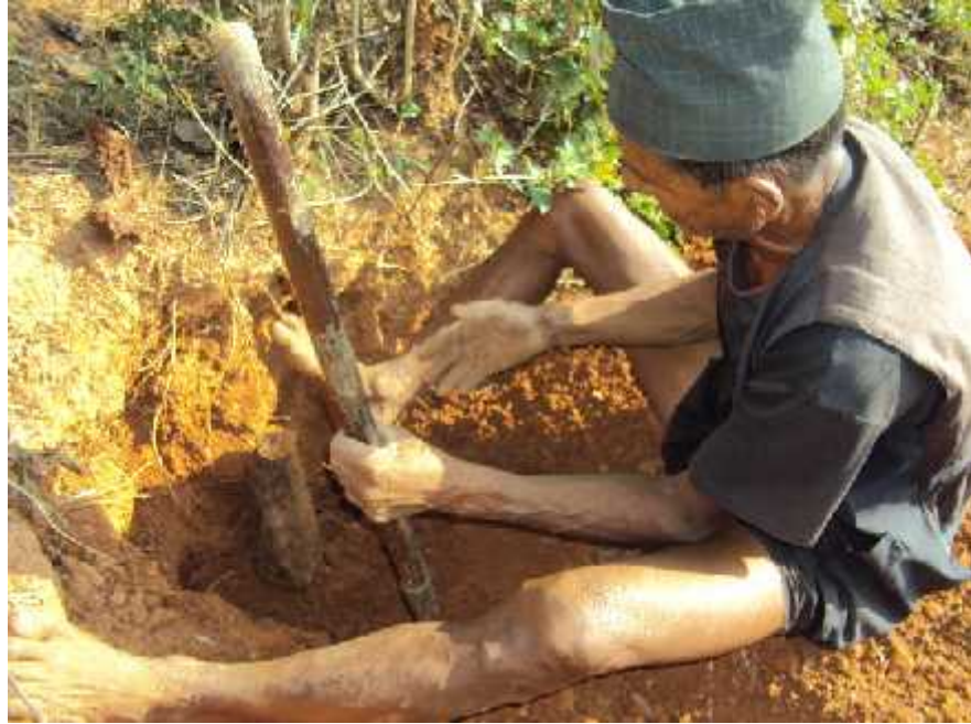
An old man digging out wild yam.