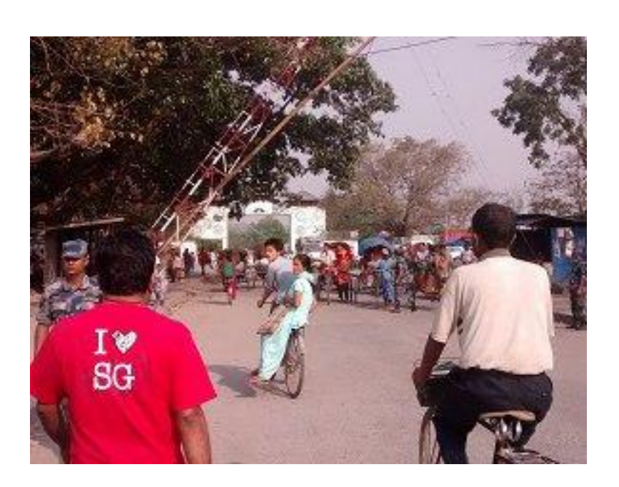
Figure 5: Border of Birjung.

security whereas on the other hand it is also important to keep in consideration that open border system has helped Nepal-India to deepen socio-cultural-economic relations. For instance, let's see the revenue's data collection after the border blockade which started from third week of September 2016, which is stated in the article of Acharya (2016), he writes that before the border blockade, the total revenue collection from all customs points of Birgunj averaged around Rupees 600 million a day and after the border blockade since mid-December per day revenue collection had exceeded Rupees 500 million even though Birgunj, the major border point remained closed. He further added, around 1545 number of vehicles entered Nepal from India via various checkpoints after the border blockade. He also highlights that Department of Customs of Birgunj contributes 50 percent to the total tax revenue so the departments target in 2015 was Rupees 78.23 million but due to border blockade they were able to collect only 46.47 billion in the first five months in 2015 (Acharya, 2016). See Figure 5.