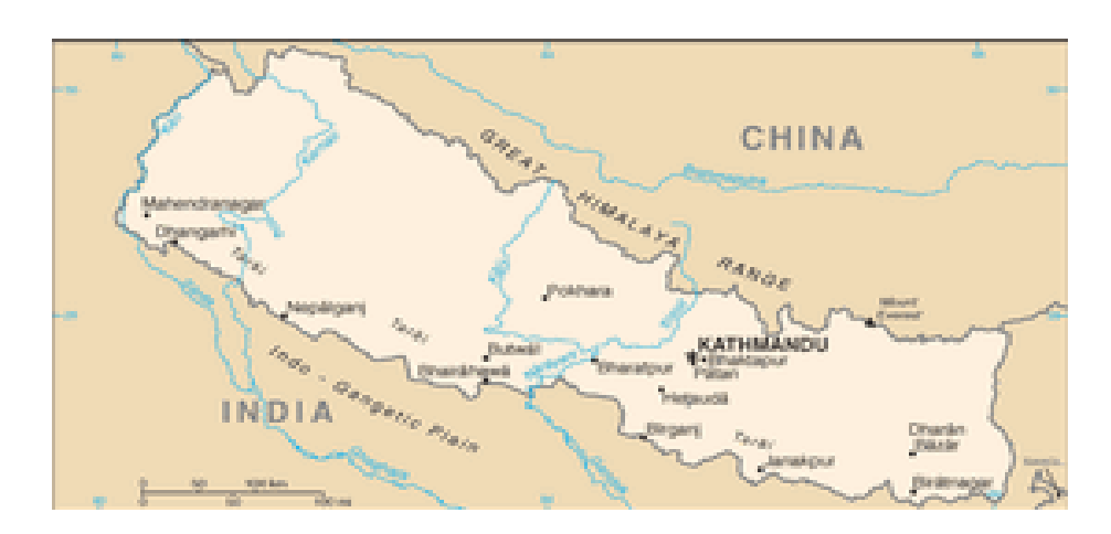
Figure 3: Nepal and Bordering Countries