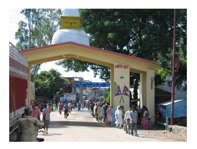
Figure 1: open border between Nepal and India, source: Nepal Mountain News.

Nepal and India have a special and unique relationship. Both nations are linked by traditions, history, geography, culture and economy. They share about 1800square kilometer (sq km) open and porous border (Kanshakar, 2001). Majority of the people have symbiotic interdependent on each other like they share same religion, culture, language (Maithali, Bhojpuri, etc.), economic relation is strong as people from border area go across border to buy goods, for employment and so on. In the formal manner, the 1950's Border Treaty or Peace and Friendship Treaty between Nepal and India allowed cross-border movements which set up the base for business activities in border area and it has been further expanded after the globalization and liberalization policies adopted by the government of Nepal in 1990s (Kanshakar, 2001).