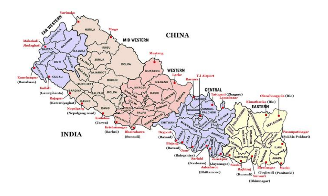
Figure 2: Map of Nepal

delimiting geographical feature that separates one country, province or state from another. Likewise, open border is a situation in which movement of people and trading or transferring of goods can be done without any restriction across the jurisdiction. Whereas restricted border means it is a situation in which people need to show document of identity and follow strict rules and procedures to do business through the border of one country to another country.