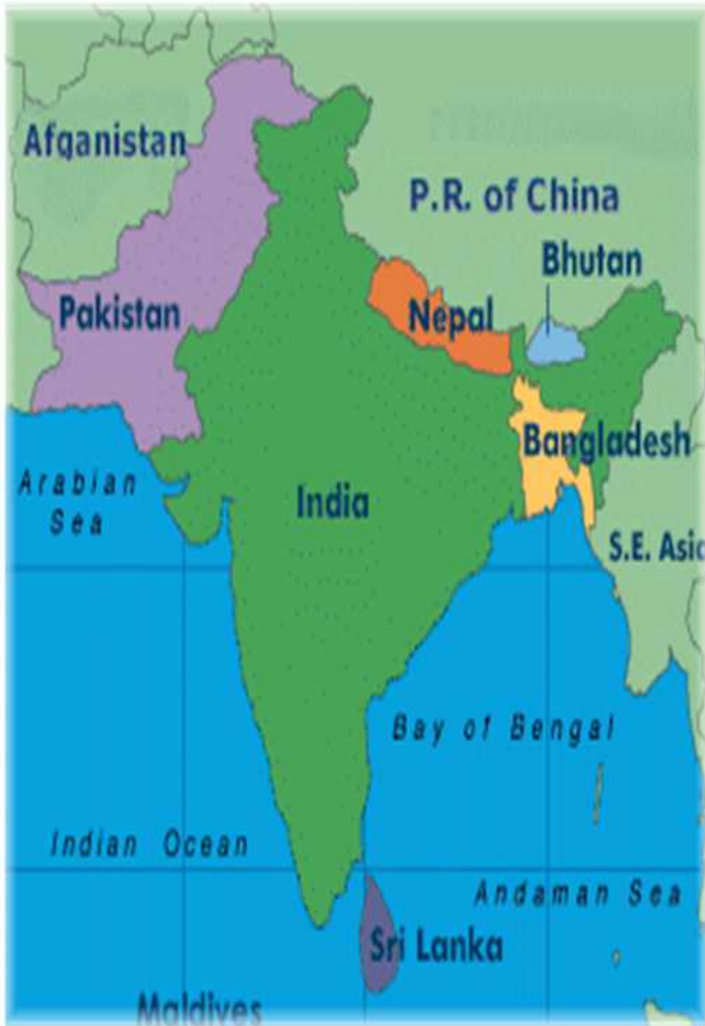
Map Locating the Country Nepal