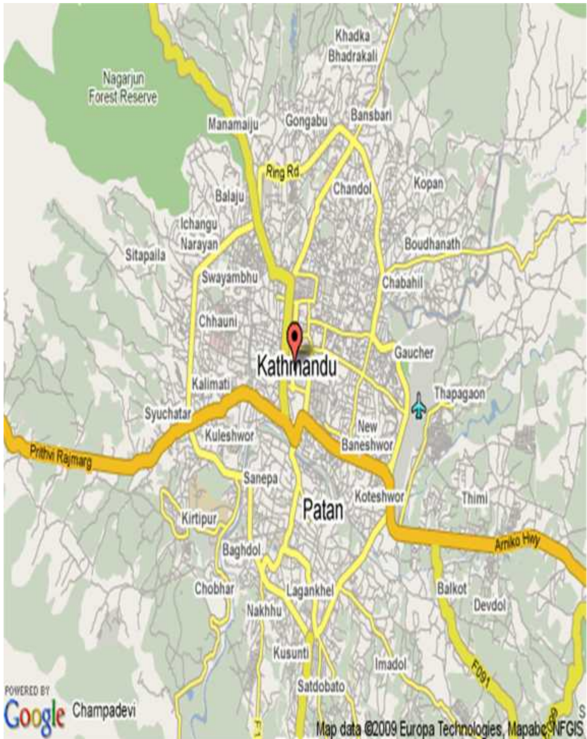
Map of Kathmandu Valley