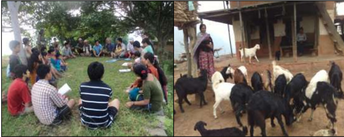
CO people are discussion in meeting