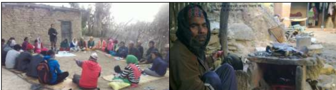
Infrastructure done by co member