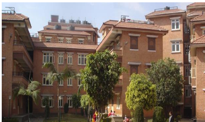
Maiti Nepal Rehabilitation Centre, Kathmandu