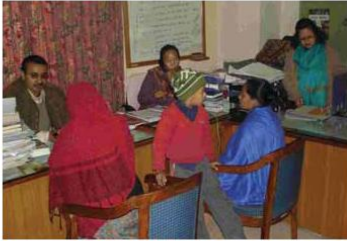
Legal Aid Section