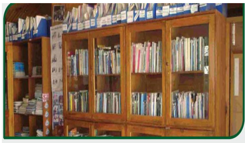
Information Centre at Maiti Nepal