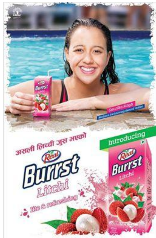
Image taken from a hoarding board attached at BP Trade, a provision store at Damside Pokhara