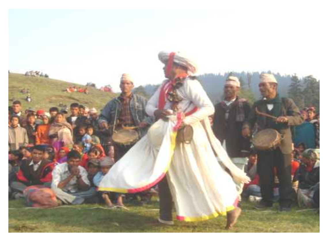
Khaptad Mahotsav at Ganga Dasahara