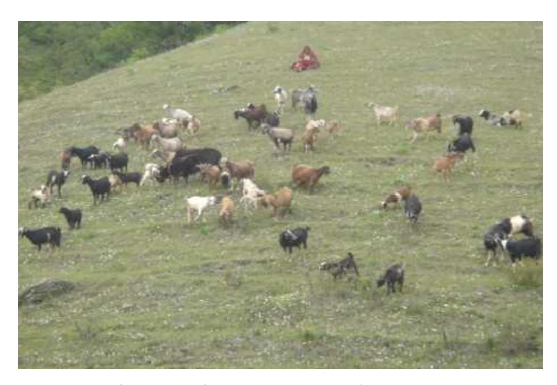
Goats of local people in Khaptad