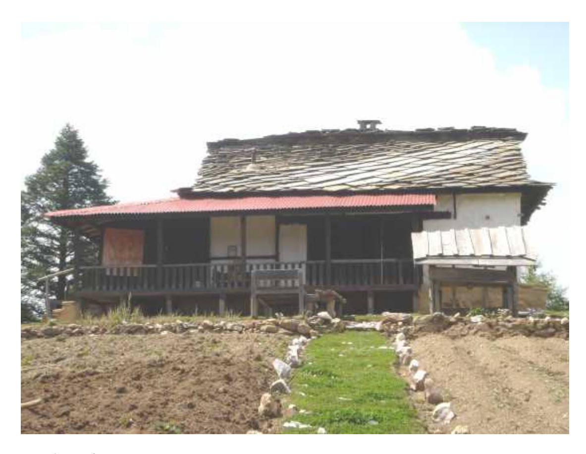
Hermitage of Khaptad Baba