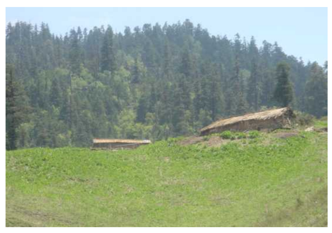
Temporary residences of local people