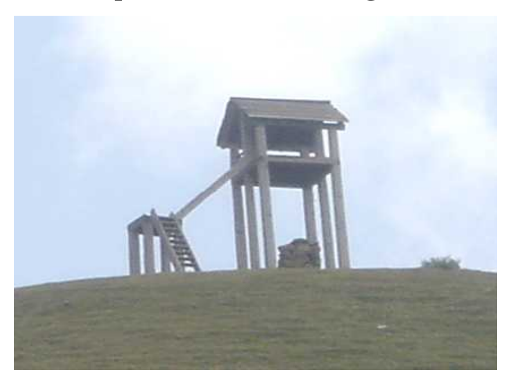
A view Tower of Khaptad