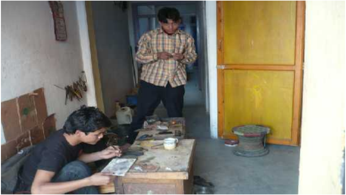
Photograph No. 9

Biswakrma's people and their new work occupation