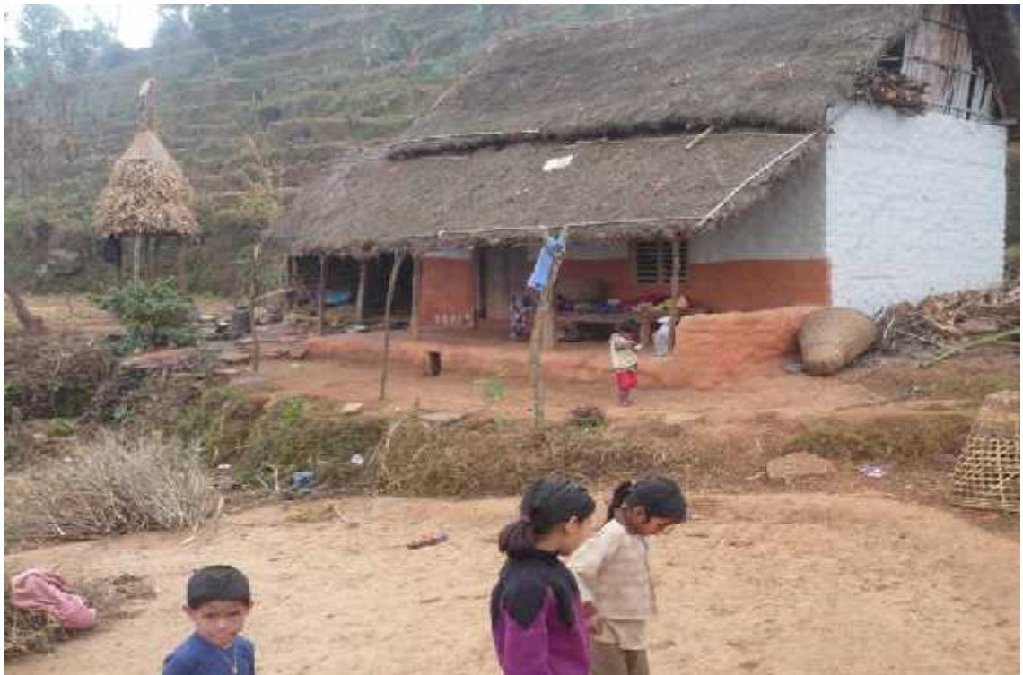
Photograph No. 6 Bishwakarma's house and their children