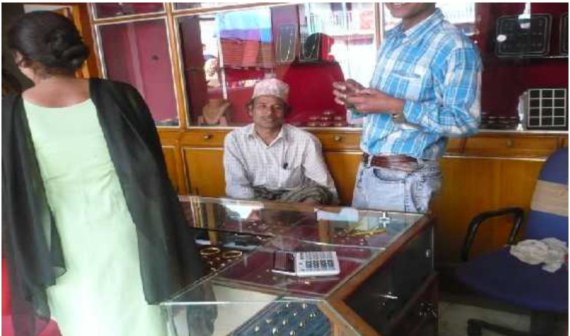
Photograph No. 10

Biswakrma's people and their new work occupation