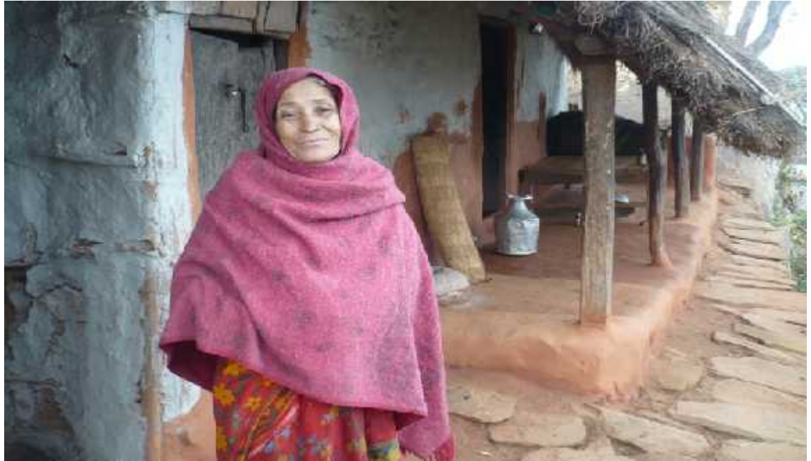
Photograph No. 5 A woman standing in front of her house