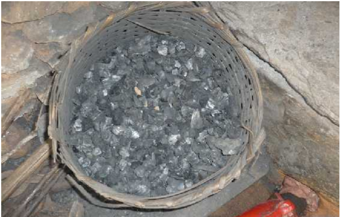
Photograph No. 4 Charcoal, fuel for furnace.