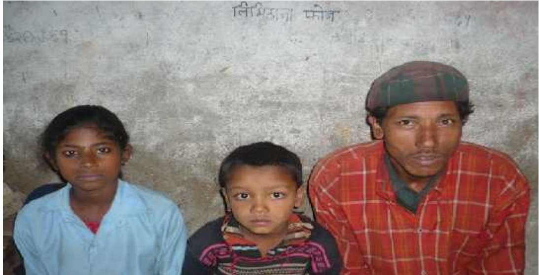
Photograph No. 7 Bishwakarma children with their father