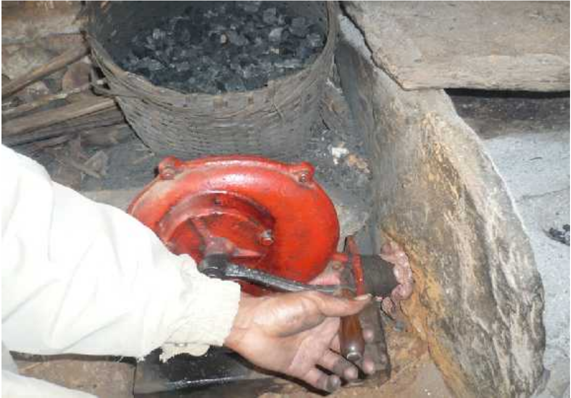
Photograph No. 3 A man is running furnace's Fan,